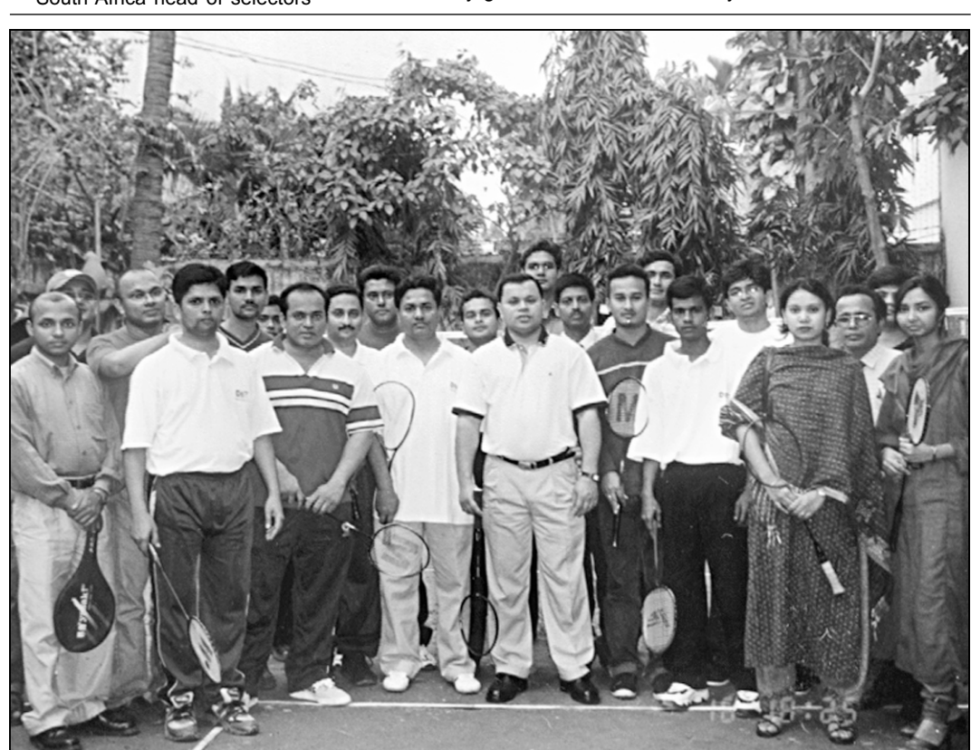
Members of the Daffodil family who took part in their Victory Day celebration badminton tournament at the institute's campus at Dhanmondi recently.

Today's Cryptogquip Clue: Z equals L. The Cryptogquip is a substitution cipher in which one letter stands for another. If you think that X equals O, it will equal O throughout the puzzle. Single letters, short words and words using an apostrophe give you clues to locating vowels. Solution is by trial and error.