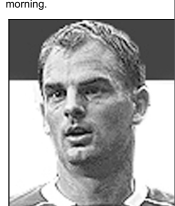
RONALD DE BOER The thieves found the keys to De Boer's BMW X5 sports car inside his house and then drove off with the vehicle in the Mearnskirch area of Glasgow.

Glasgow Rangers' Dutch international Ronald de Boer had his car stolen after thieves broke into his house here in the early hours of Monday morning.