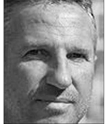
IAN BOTHAM "One of my fondest memories as a player was the week England clinched the Ashes, inside barely three days, at the MCG in 1986-7,"

And he maintained that England, already 3-0 down in the best of five Test series, could do worse than start their recovery this week at the Melbourne Cricket Ground (MCG).