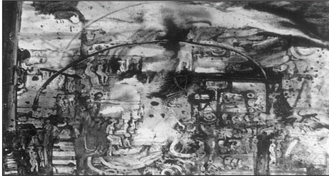
From city life-1 (water-colour)

We see swirls, rectangles, semi-circles, loops and bars of colours which vary from cobalt blue to paler shades of sky blue, along with orange, russet and gray-green in Rafiqul's "From City Life-1". Bars and splashes of gray are included in the right end and in the backdrop as also in the body of the painting. Minute geometrical shapes have been used to work on the main body of the water-colour creation. The lines are bold and so are the