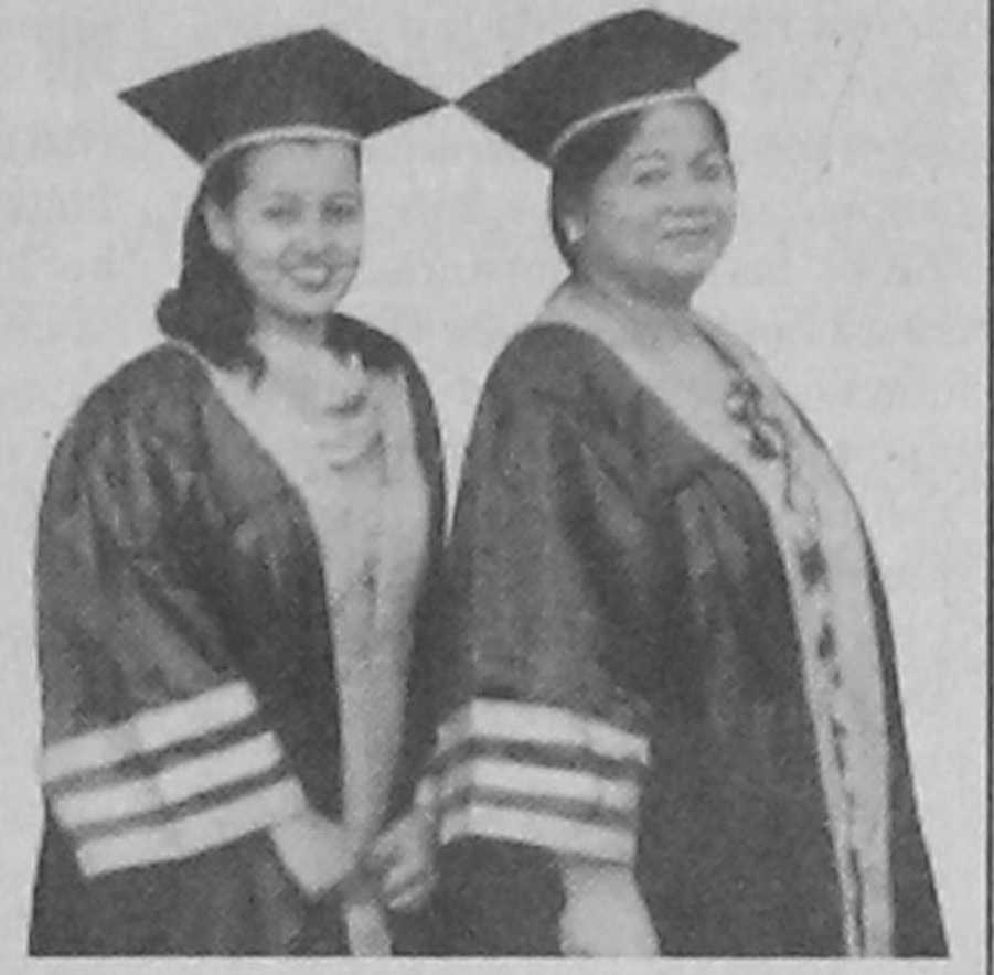
Female MBA Graduates of IIUC Dhaka Campus

Last date of application is 02 January and viva-voce at 10:00 a.m. on 03 January 2003.