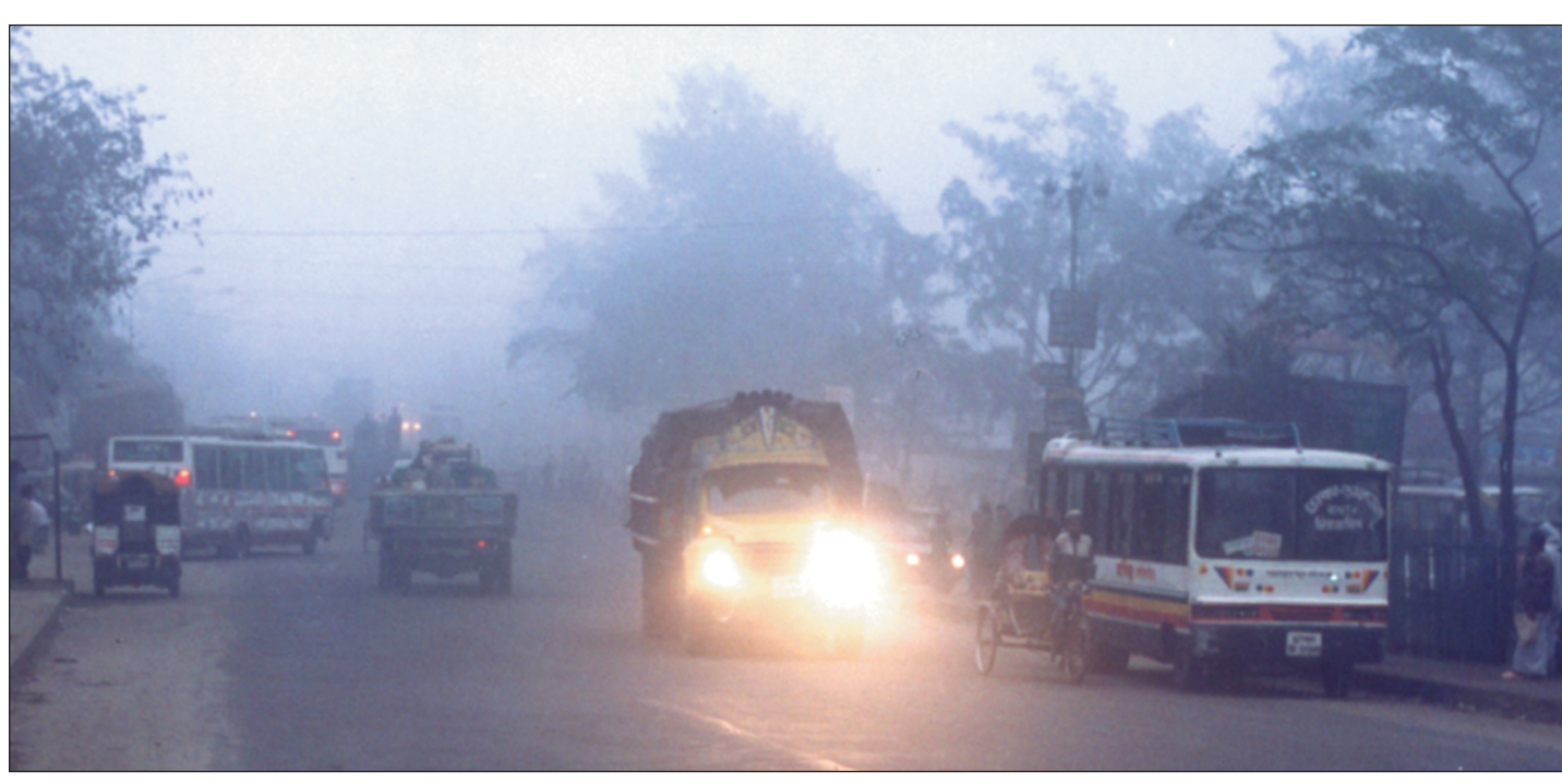
A truck on a city road blazes headlights yesterday morning to fight its way through dense fog that has blanketed roads and rivers across the country over the last couple of days