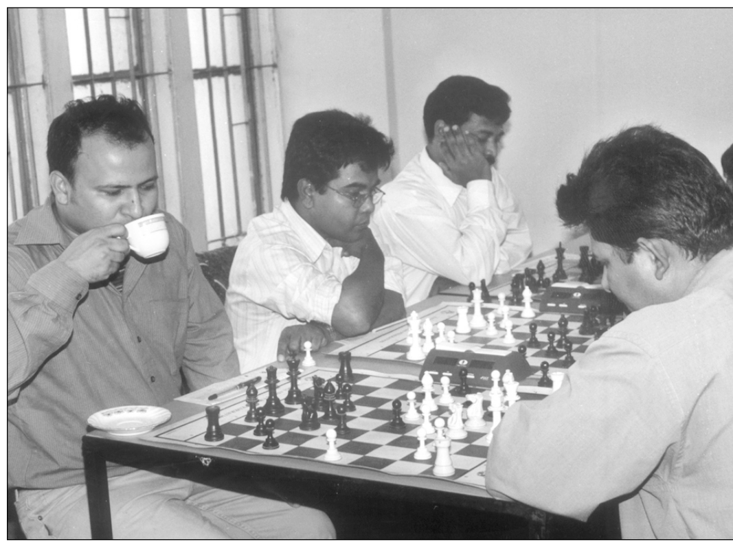
Scene from the ninth round of the First Division Chess League at the National Sports Council chess room yesterday.

Lara will be desperately short of match practice come the World Cup but his genius is such, that it is unlikely the selectors will leave him at home.