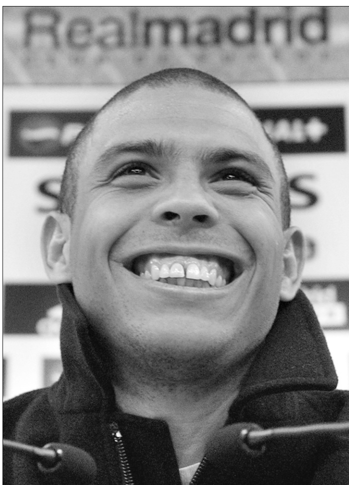
RONALDO... eager to play in England?