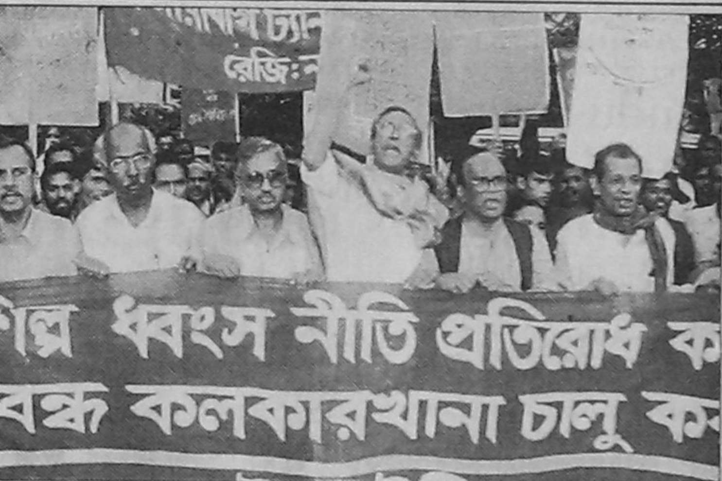
The Bangladesh Trade Union Kendra staged a demonstration in the city yesterday demanding reopening of the closed mills and factories.