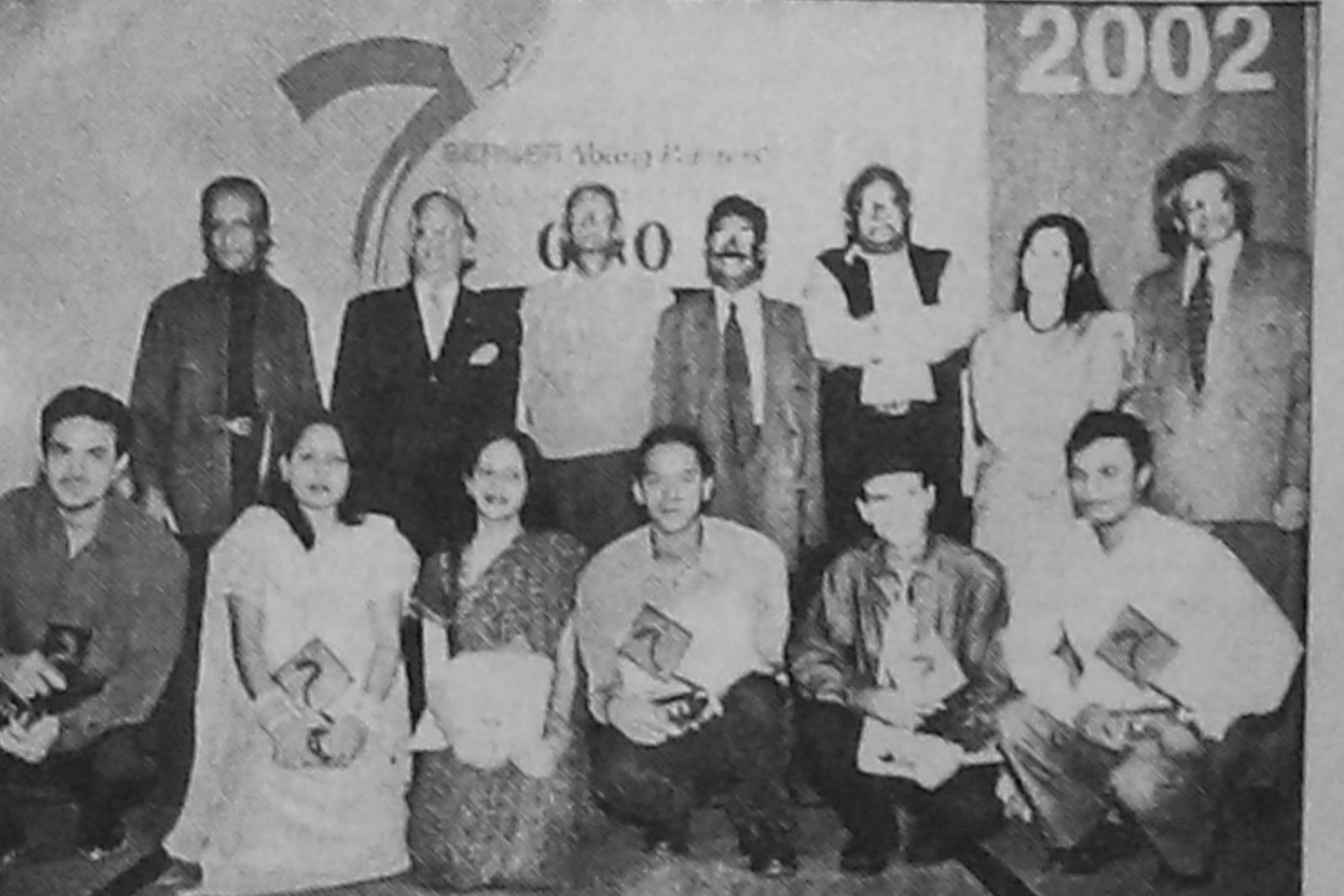
The six winners of the 7th Berger Young Painters' Art Competition pose with the guests at the award giving ceremony held at a city hotel on Friday.