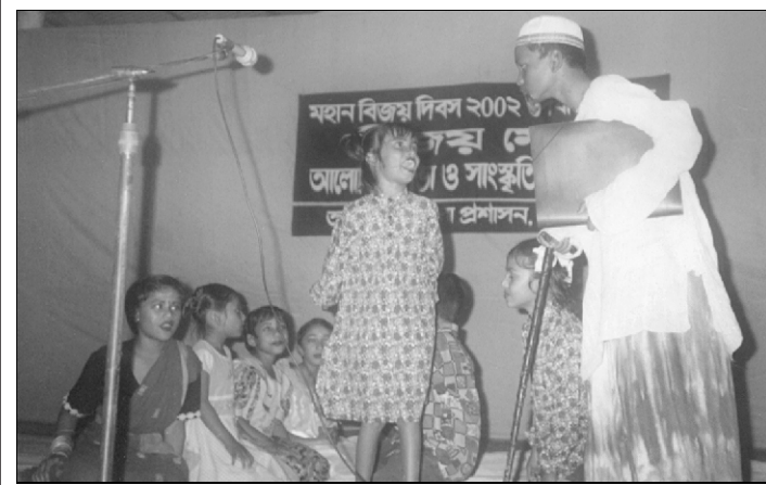
A sequence from a drama staged by some child artists on the premises of Swadhinata Bhaban on the occasion of Bijoy Mela in Gaibandha recently. The district administration organised the drama as part of their Victory Day programme.