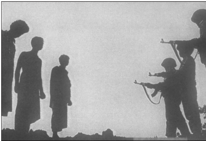
Shei Raat-er Katha Boltey Eshechi

JUST ahead of the official victory in the nine-month's armed struggle against the then West Pakistan military forces, Bangladesh had to make its final sacrifice on 14 December 1971. A whole generation of the country's most brilliant sons and daughters, who would have shaped the new born nation in an enlightened spirit, were most brutally assassinated in a heinous pre-planned drive carried out by the Pakistan army with the help of the traitor Razakaar, Al-Badr and Al-Shams activists.