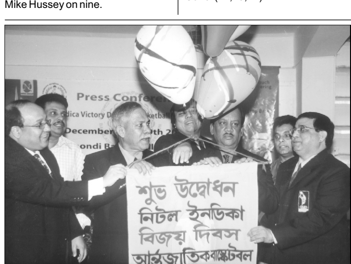
State Minister for Youth and Sports Fazlur Rahman (3rd from R) inaugurates the Nitol-Indica Victory Day International Basketball Championship at the Dhanmondi basketball gymnasium yesterday.