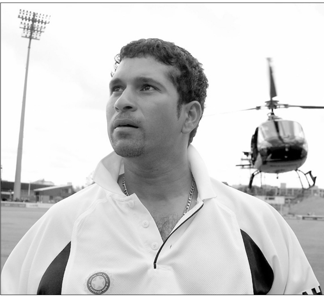
Indian master batsman Sachin Tendulkar looks at the sky while a helicopter flies low to dry out the outfield of the Westpac Park in Hamilton yesterday.