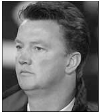
LUIS VAN GAAL

Michael Reiziger and Patrik Andersson are both out until at least