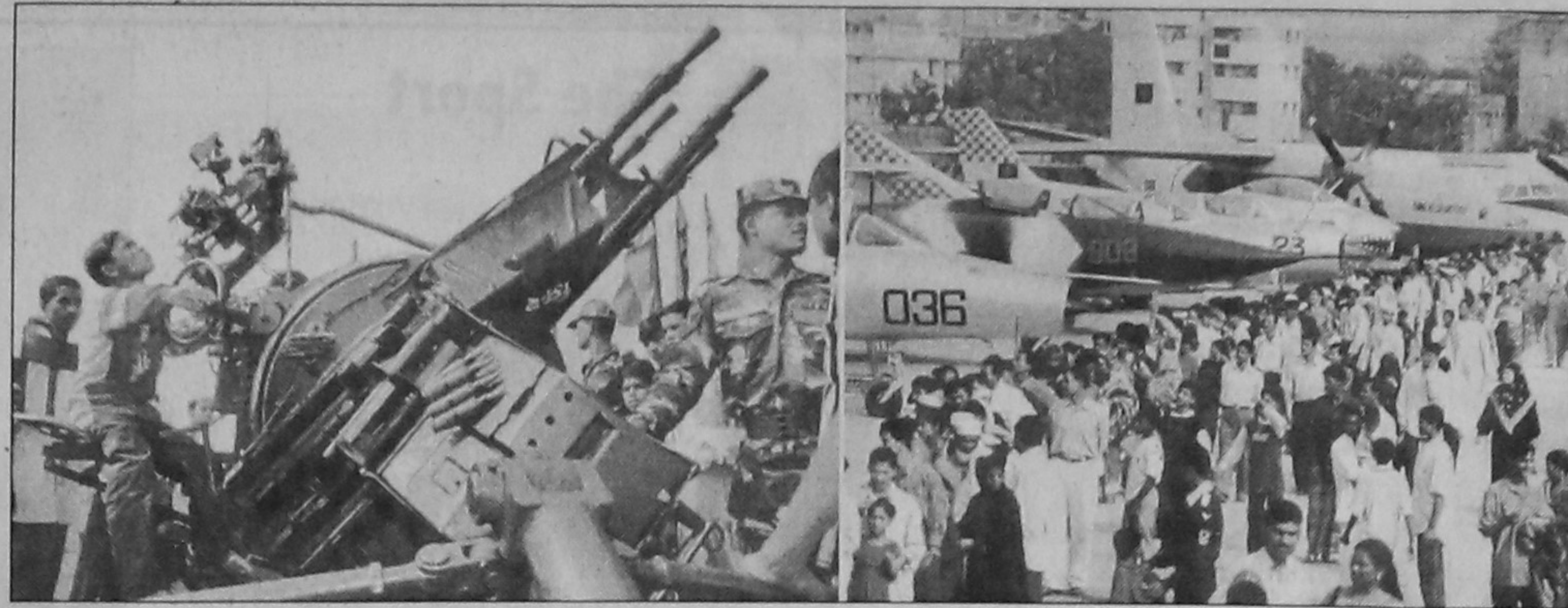
People visit the military hardware exhibition at the National Parade Ground in the city. The show that began on December 16 on the occasion of Victory Day will end today.