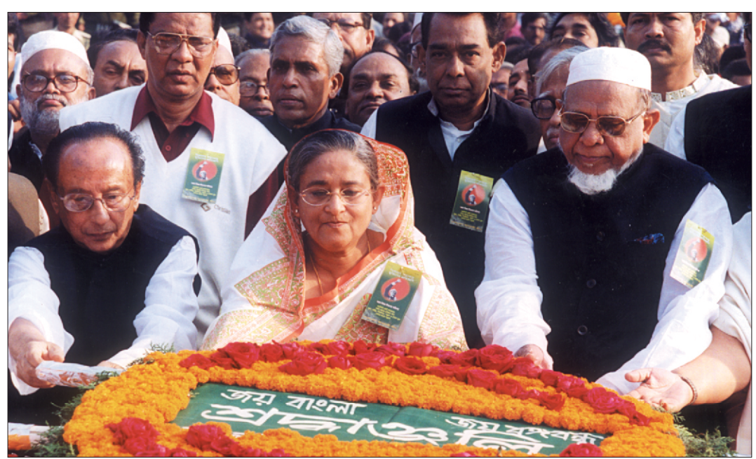
Leader of the Opposition in Parliament and Awami League chief Sheikh Hasina along with senior party leaders places wreaths at the National Memorial at Savar on the Victory Day.

The walls without provision for fences for thoroughfares may also cause disaster from natural calamity SEE PAGE 11 COL 1