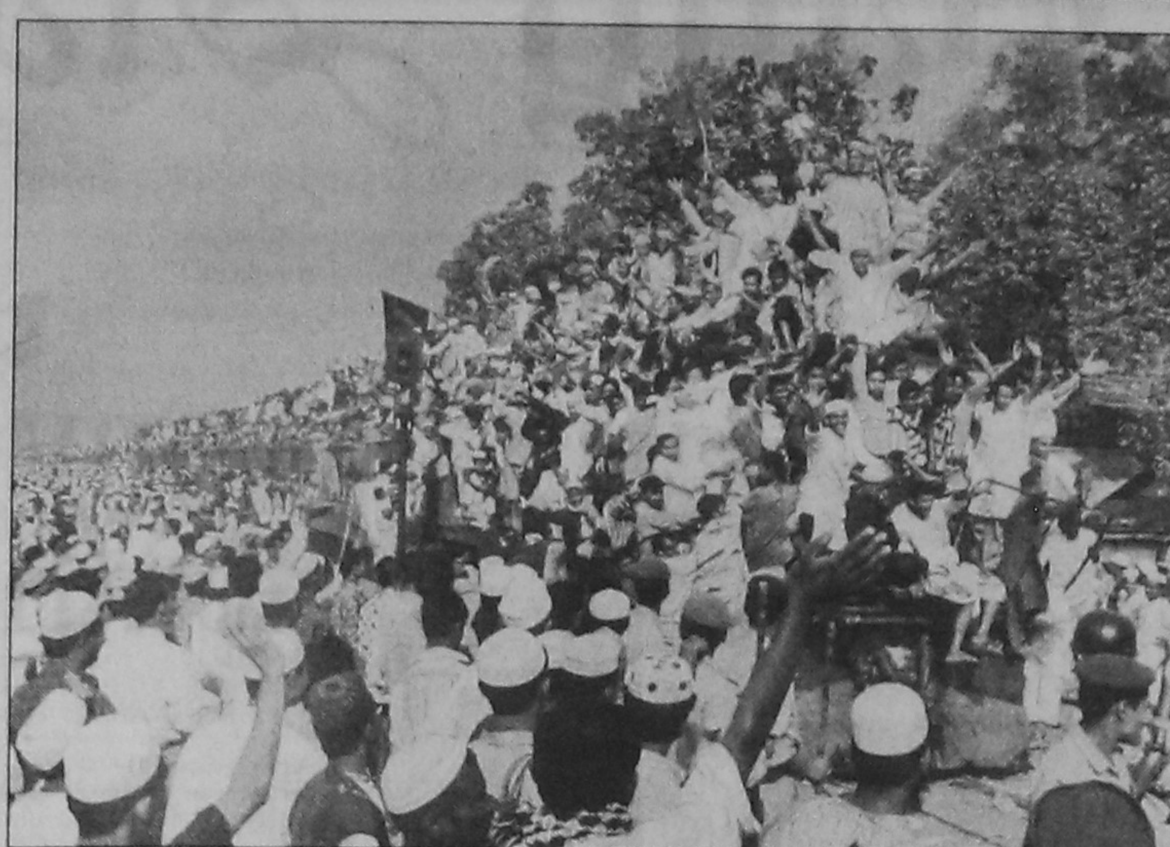
Devotees cling to a train at Tongi to return home at the end of three-day Biswa Ijtema yesterday.