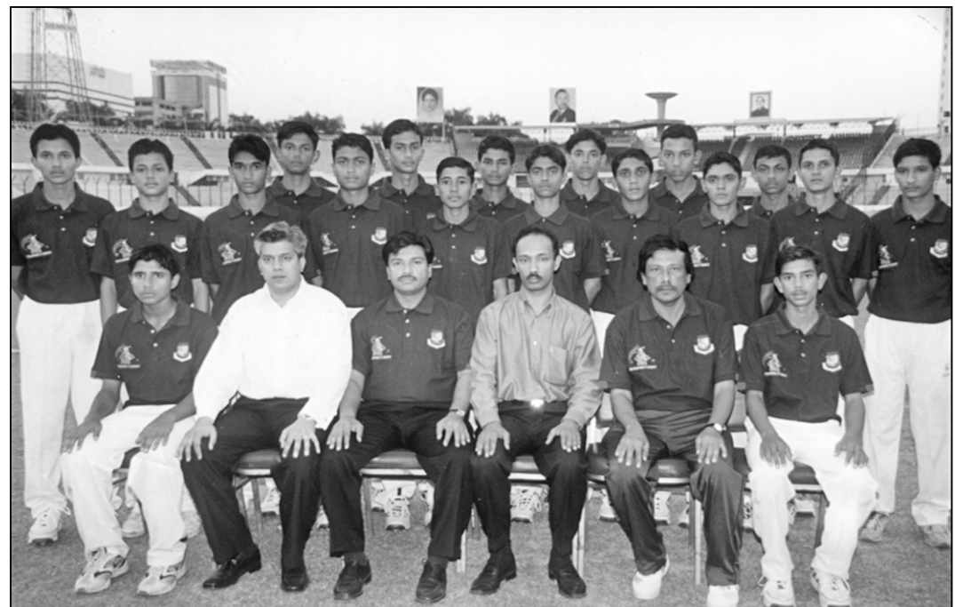
Players and officials of the Bangladesh U-15 cricket team.

BOWLERS 1. Wasim Akram (Pakistan) 2. Allan Donald (South Africa) 3. Waqar Younis (Pakistan) 4. Glenn McGrath (Australia) 5. Joel Garner (West Indies) 6. Saqlain Mushtaq (Pakistan) 7. Muttiah Muralitharan (Sri Lanka) 8. Shaun Pollock (South Africa) 9. Shane Warne (Australia) 10. Dennis Lillee