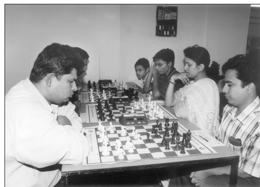
Scene from the third round of the First Division Chess League yesterday.