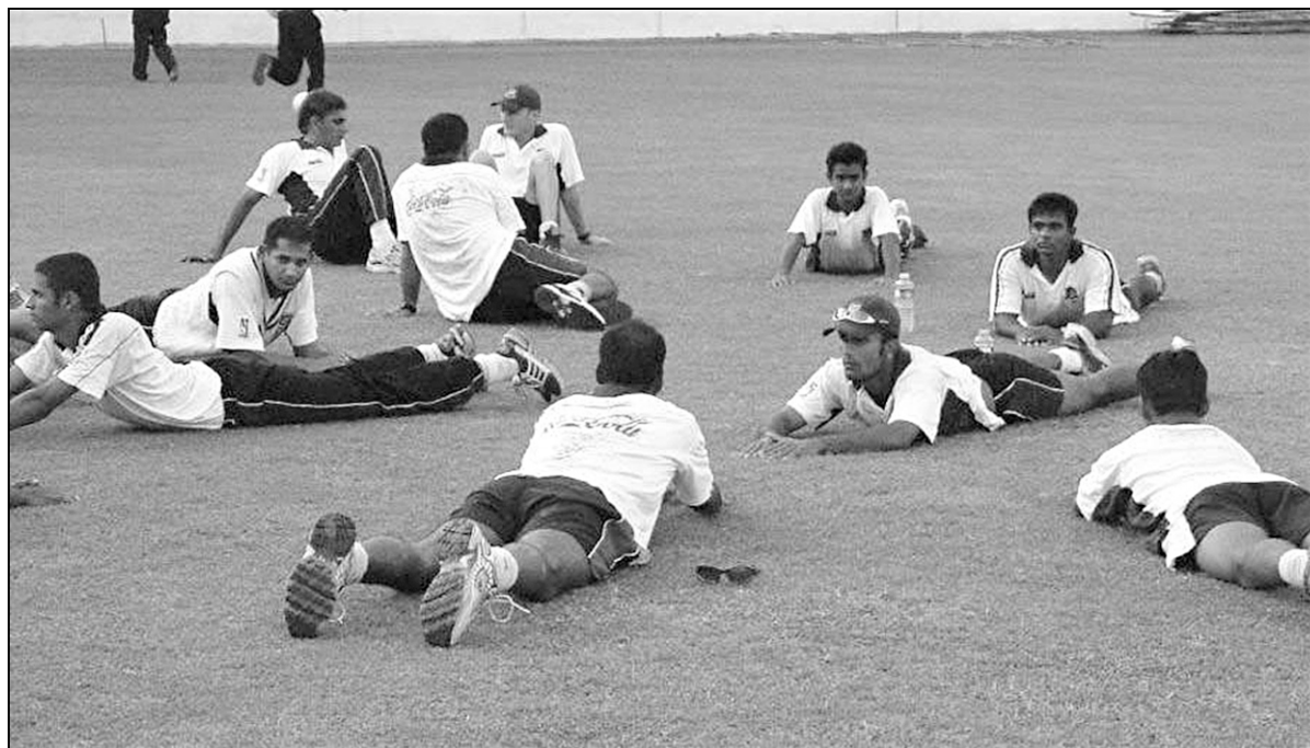
CONTRASTING DAY IN CHITTAGONG: While the Bangladesh cricketers (L) had a busy day's workout at the MA Aziz Stadium, (R) West Indies' (L-R) Ridley Jacobs, Ricardo Powell and an unknown player went shopping in Chittagong yesterday. The two teams reached the port city yesterday to play the second and final Test from tomorrow.