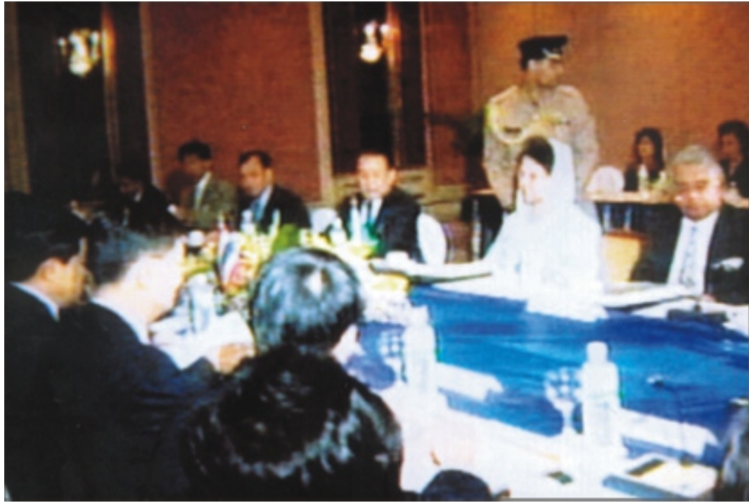
Prime Minister Khaleda Zia and Thai Prime Minister Thaksin Shinawatra lead delegations to official talks between Bangladesh and Thailand at the Westin Hotel in Chiang Mai, Thailand, yesterday.