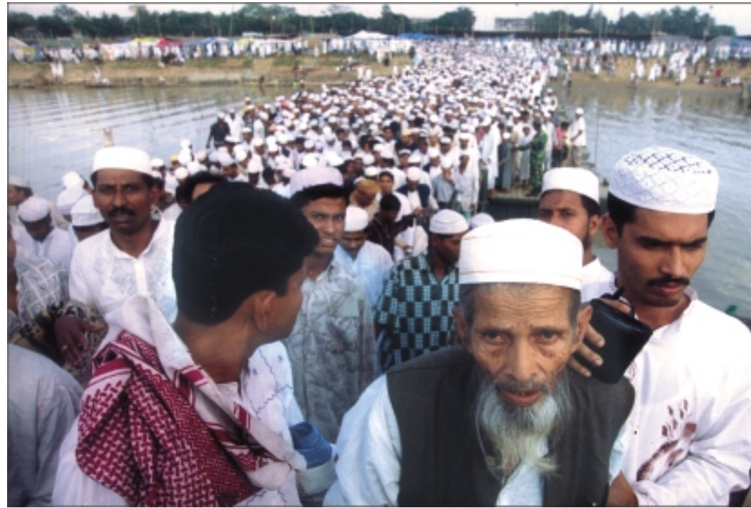
A septuagenarian is helped to the venue for the three-day Biswa Ijtema, the second largest congregation of Muslims after Hajj, which began on the bank of the Turag in Tongi yesterday.