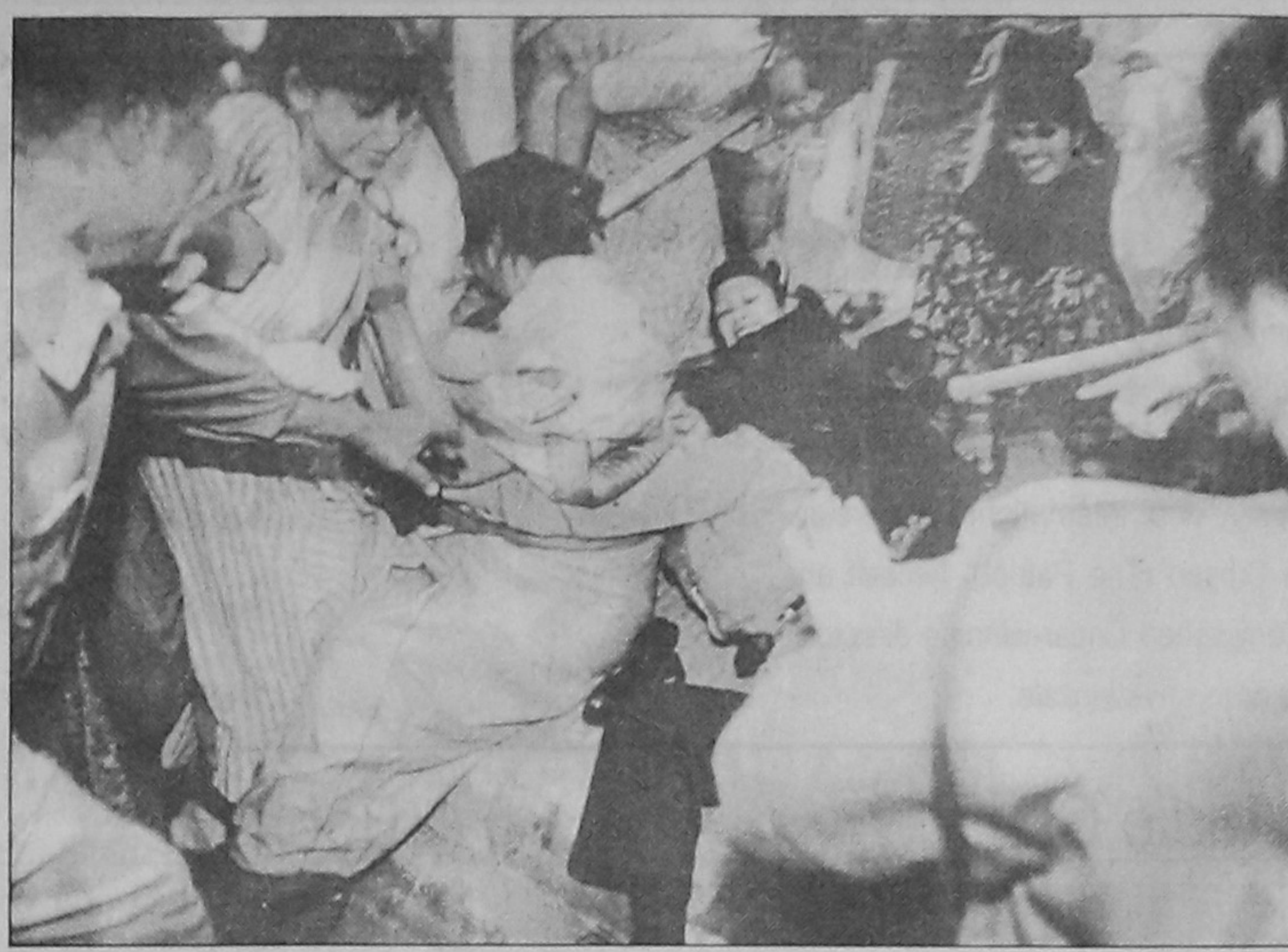
Police scuffled with Awami Mohila Jubo League activists when they tried to form a human chain in front of the High Court in the city yesterday protesting arrest of AL leaders.