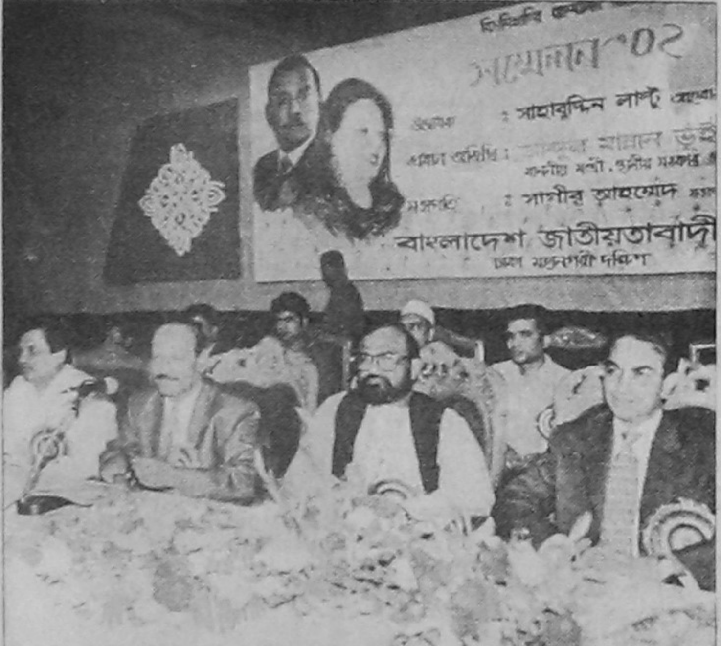
A conference of Dhaka City Unit of Jatiyatabadi Chhatra Dal was held at Mahanagar Nityamancha in the city yesterday. BNP Secretary General and LGRD and Cooperatives Minister Abdul Mannan Bhuiyan was the chief guest at the conference.