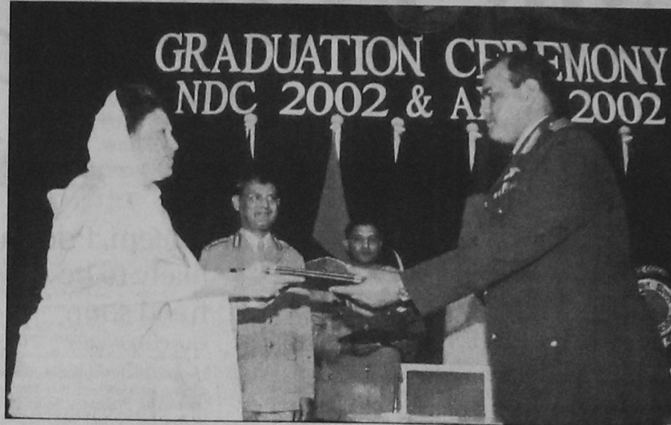
Prime Minister Khaleda Zia distributes certificates among the participants of the 4th National Defence Course and the 2nd Armed Forces War Course of National Defence College in the city yesterday.

Course. The prime minister distributed certificates among the participants and had a photo session with the course members and senior civil and military officials. Turning to the ongoing joint operation to curb terrorism and seize illegal arms, Khaleda thanks members of the armed forces for helping the civil administration in improving the law and order in the country. Later, she chaired the fourth joint governing body meeting of the NDC and Defence Services Command and Staff College. Chiefs of the three services and other civil and military officials and vice chancellors of the universities concerned attended the meeting.