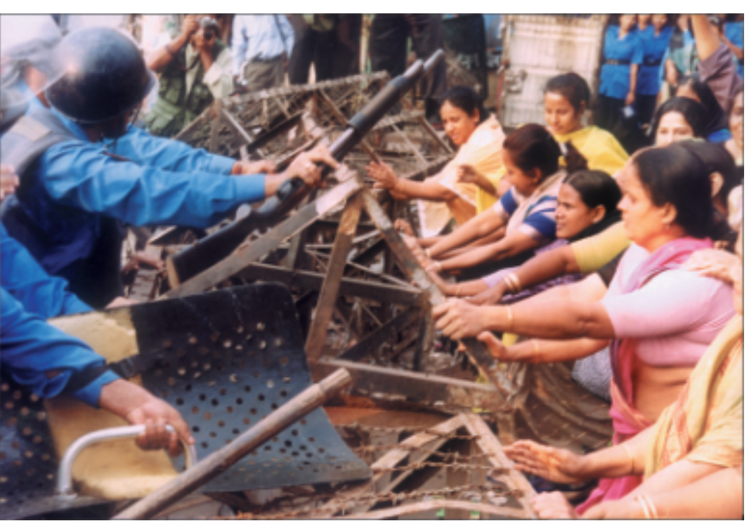
Women activists of the Awami League try to push off police barricades during a rally, staged in the city yesterday to

protest arrest of leaders and activists of the main opposition party.