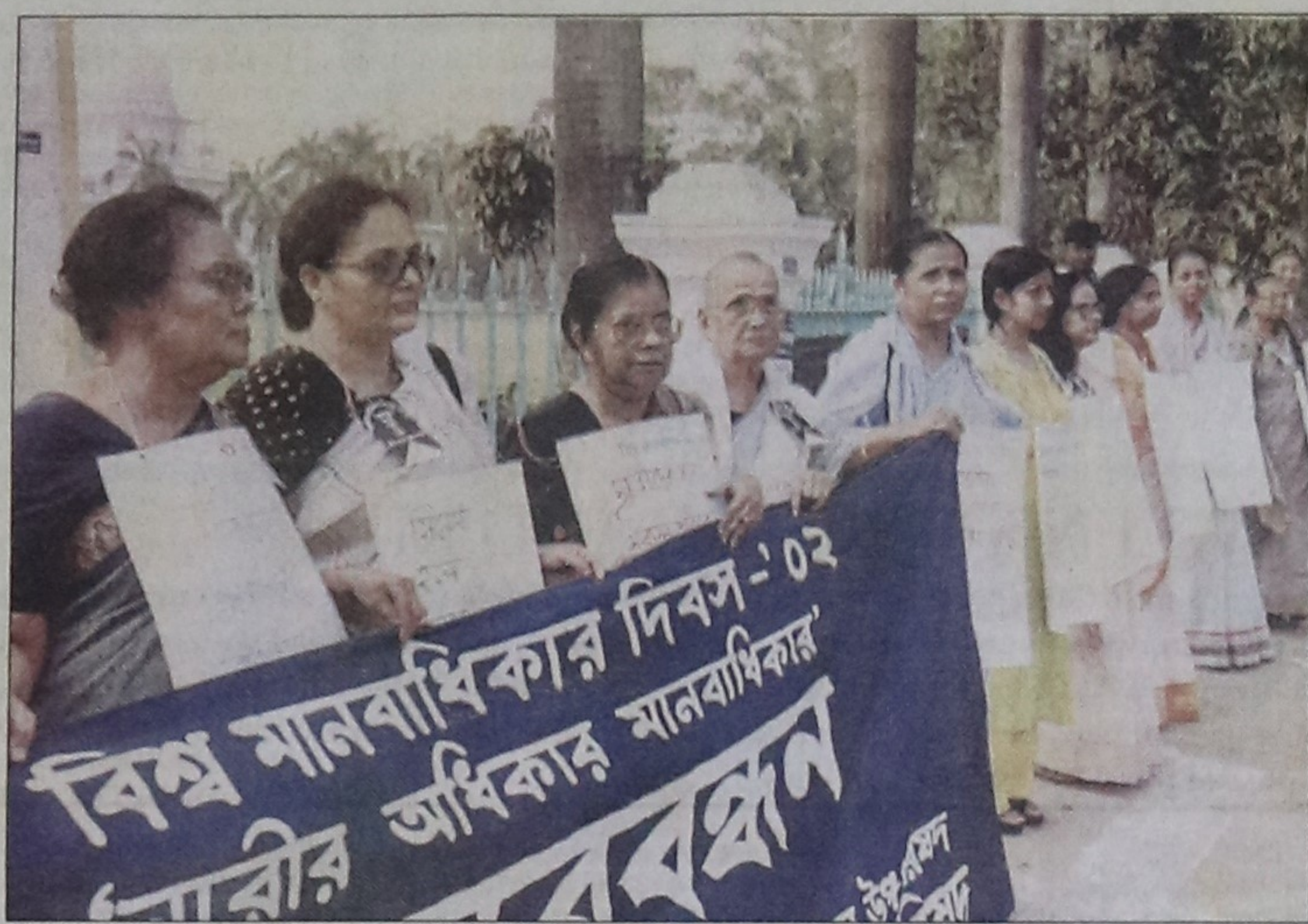
Bangladesh Mahila Parishad formed a human chain in observance of Human Rights Day in front of the High Court in the city yesterday.

She, however, assured the minister of her cooperation for further strengthening the bilateral relations.