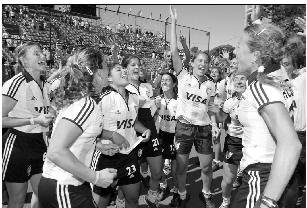
Argentine players jubilate after winning the Women's Hockey World Cup in Perth yesterday.

"I knew after Netherlands scored that my team would still win as I was