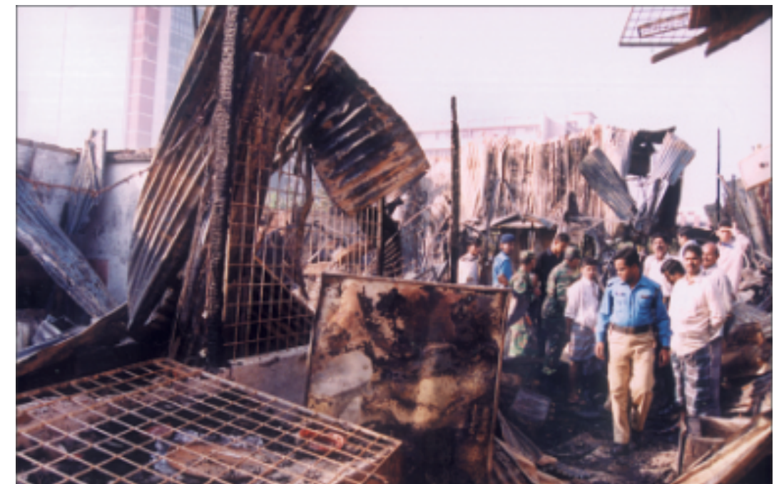
Police and army personnel make their way through the rubble and debris of the burnt-down shops at the Hasina Kitchen Market of Karwan Bazaar in the city. A fire sparked by an electric short circuit gutted a large number of shops Friday night.