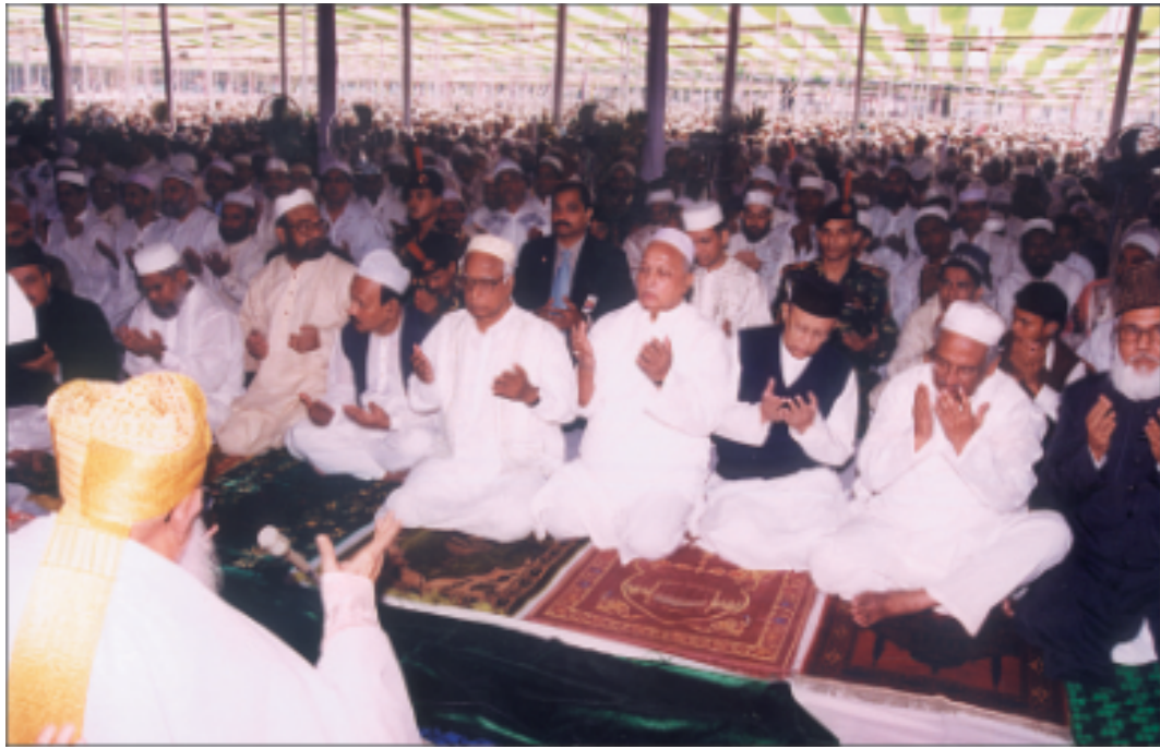
President Iajuddin Ahmed, Speaker Jamiruddin Sircar, Mayor Sadeque Hossain Khoka, Finance Minister M Saifur Rahman and LGRD Minister Abdul Mannan Bhuiyan among others offer Eid prayers at the National Eidgah in the city Friday.