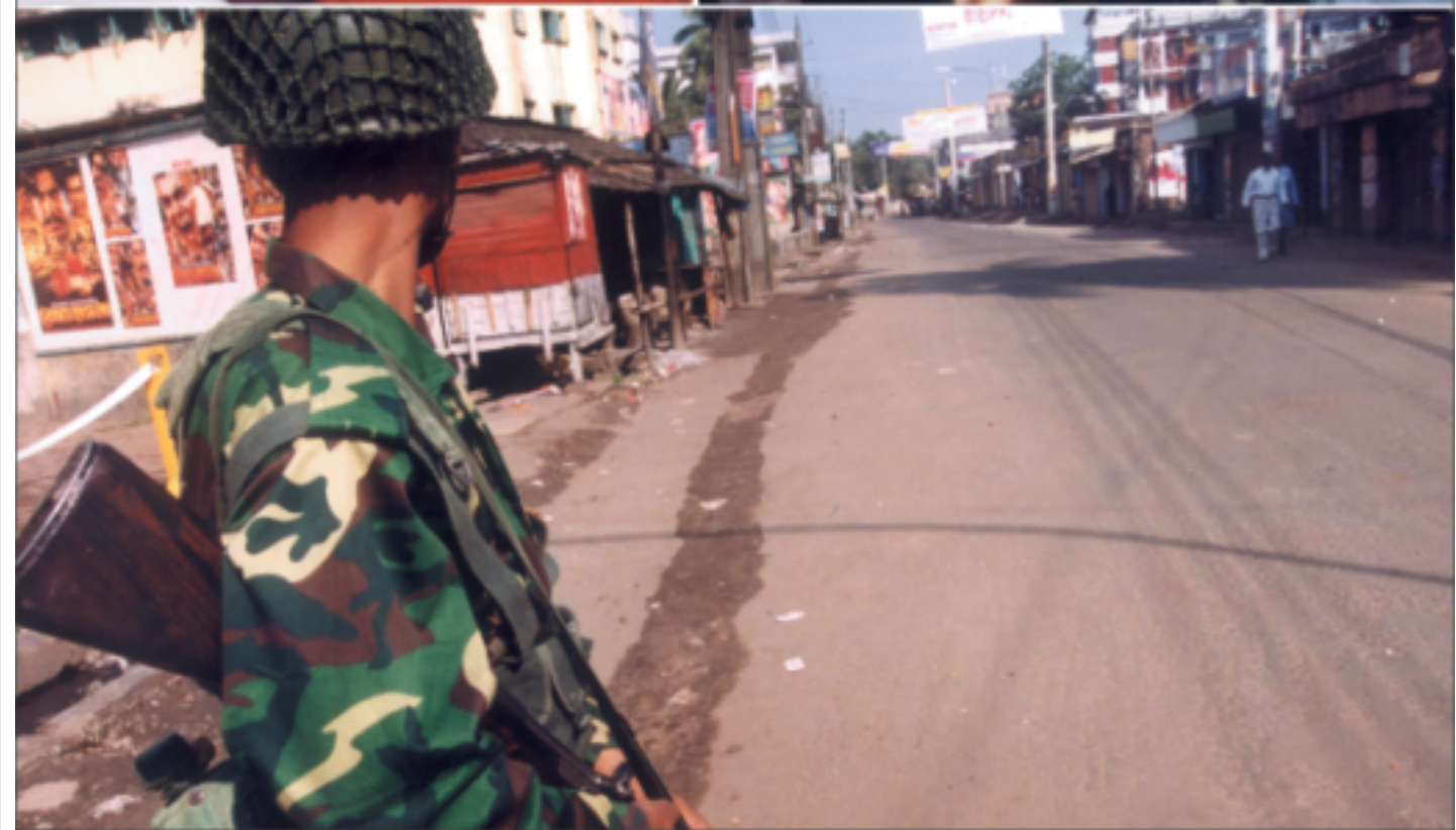
Prime Minister Khaleda Zia visits a bomb blast victim at the Mymensingh Medical College Hospital yesterday; a father, right above, breaks down upon hearing the death of his only son in one of the bomb blasts; and an army man, below, stands guard on a near-deserted road in Mymensingh town in the wake of a series of explosions at four movie theatres in the town that killed 17 people.