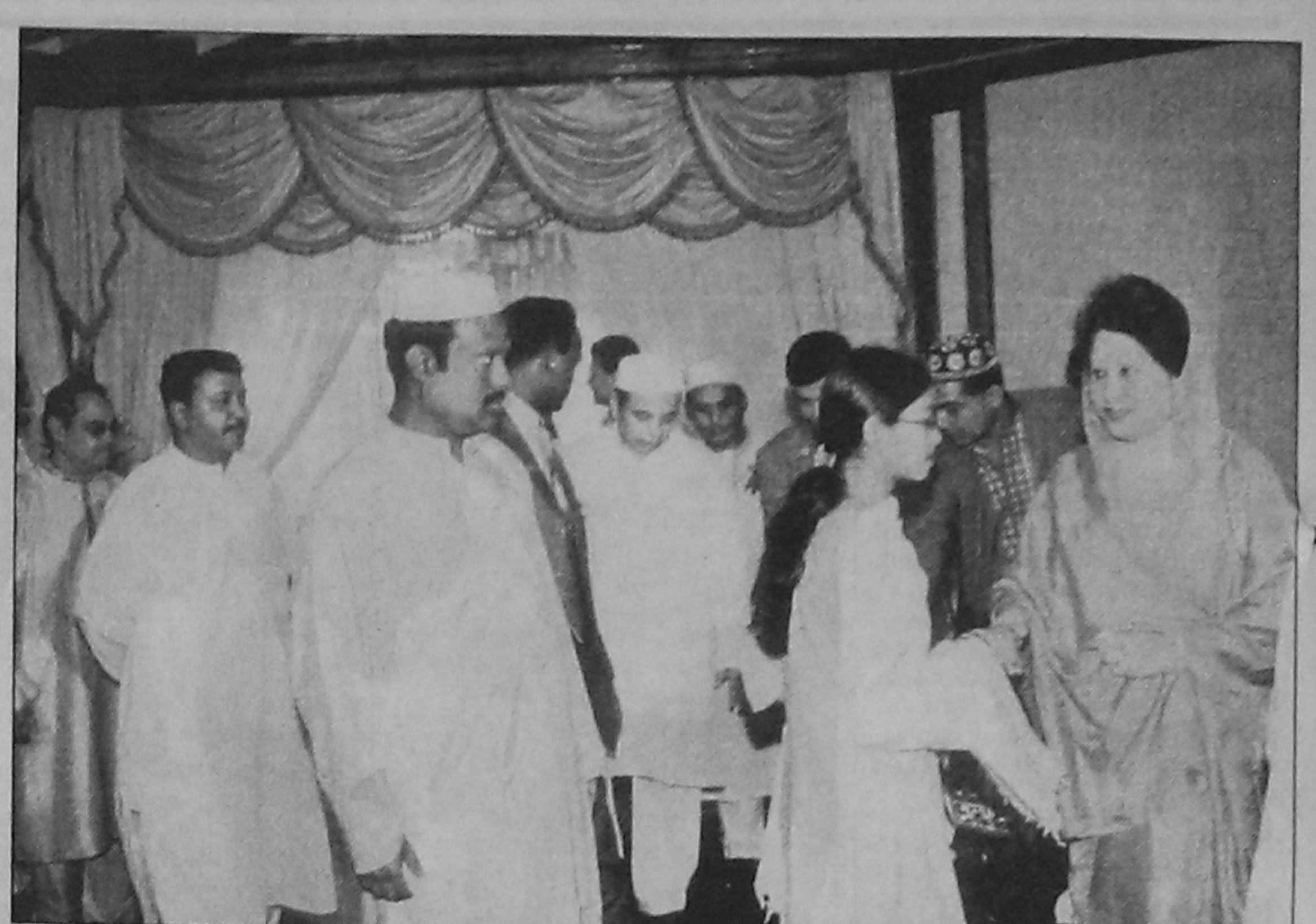
Prime Minister Khaleda Zia exchanges Eid greetings with people from all walks of life at Prodhanmontri Bhaban in the city on Eid day.

At least 23 people have died in a wave of violence around Colombia including seven rebels killed in a foiled bomb attack on a strategic oilfield, authorities said Saturday. Two indigenous leaders, a teacher and a farmer were murdered late Saturday by unidentified gunmen, and another two indigenous people were kidnapped in Florida, southwest of Bogota, in one of the worst incidents. And seven National Liberation Army (ELN) leftist rebels were killed as they attempted to bomb the Cano Limon oil field, one of the biggest in the South American