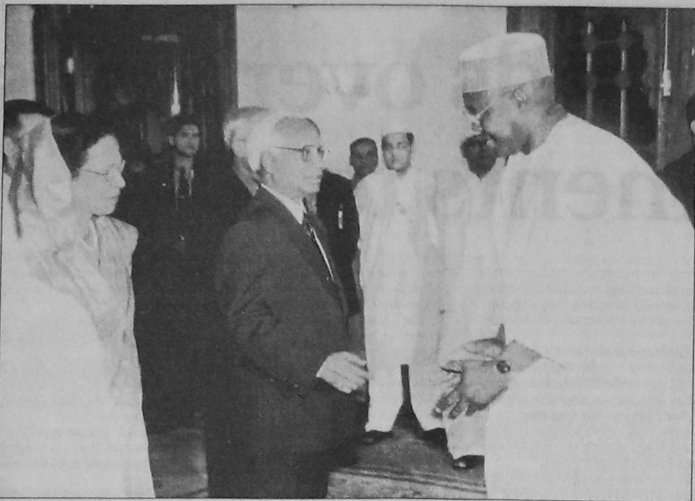
President Iajuddin Ahmed exchanges Eid greetings with the diplomats at Bangabhaban in the city on Eid day.