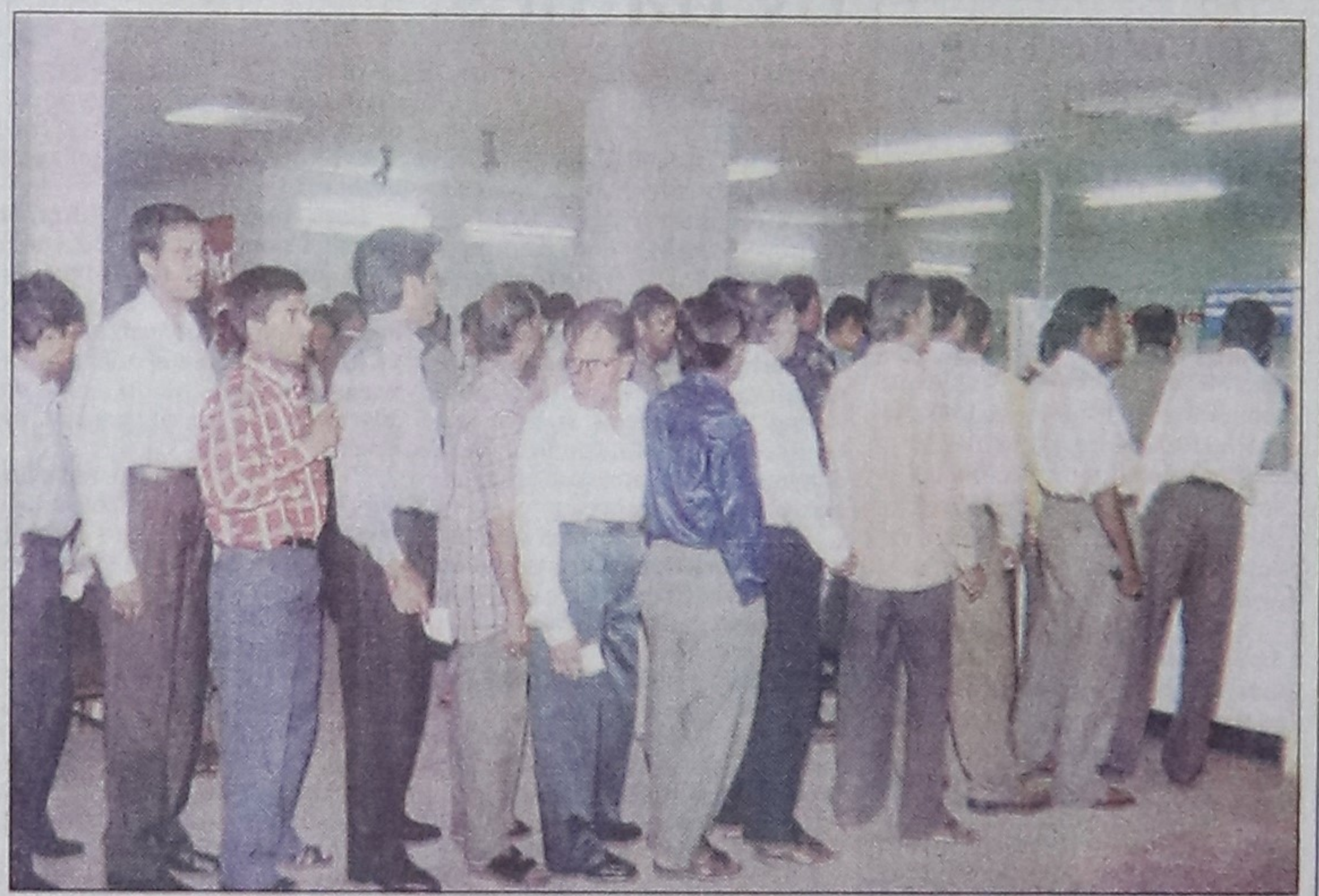
People queue up in front of a counter at a bank in the city yesterday. A large number of people drew money yesterday, the last working day before Eid.