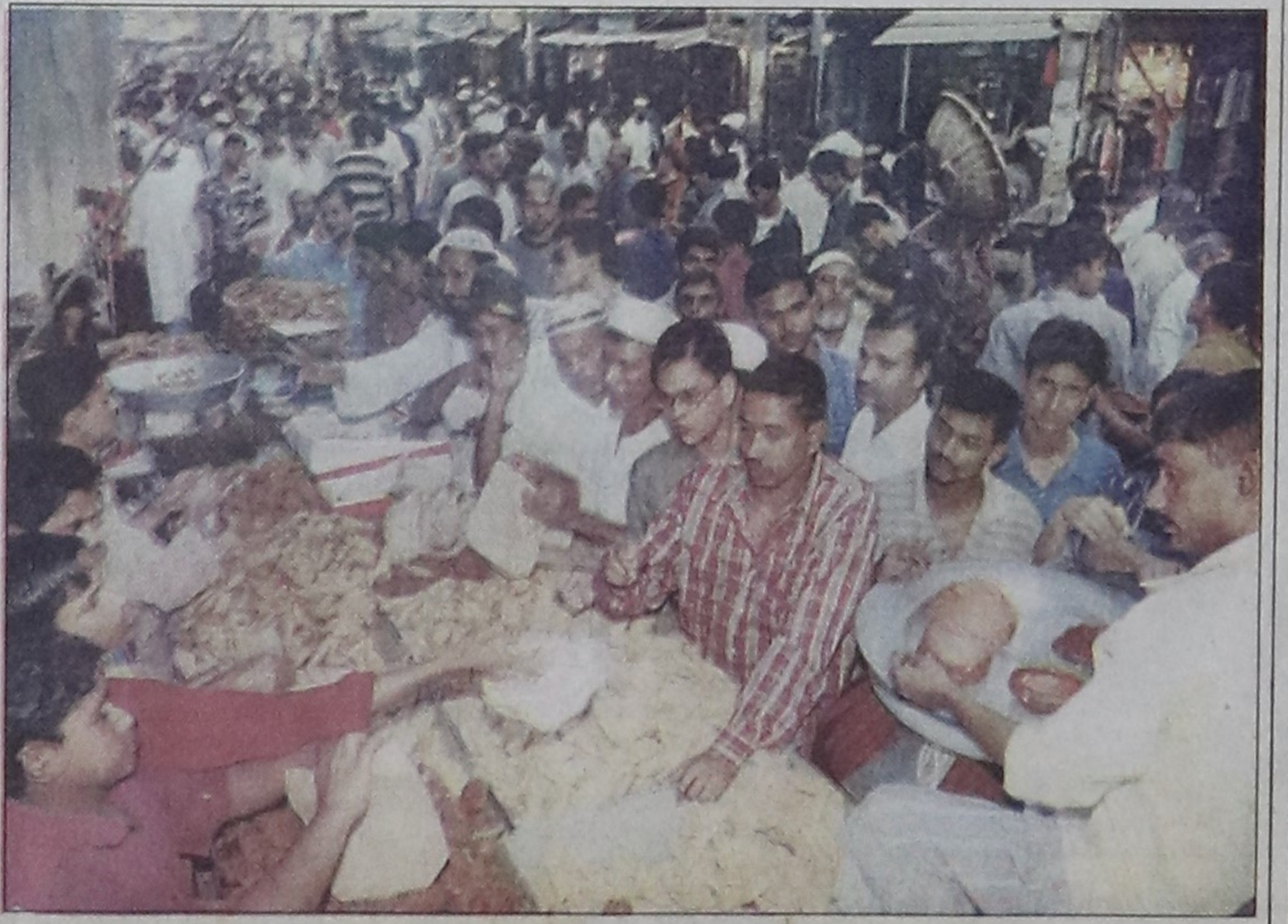
People buy Iftar items from a shop in the city yesterday. Although most of the city dwellers are leaving for their village home, there is no marked drop in the number of buyers.