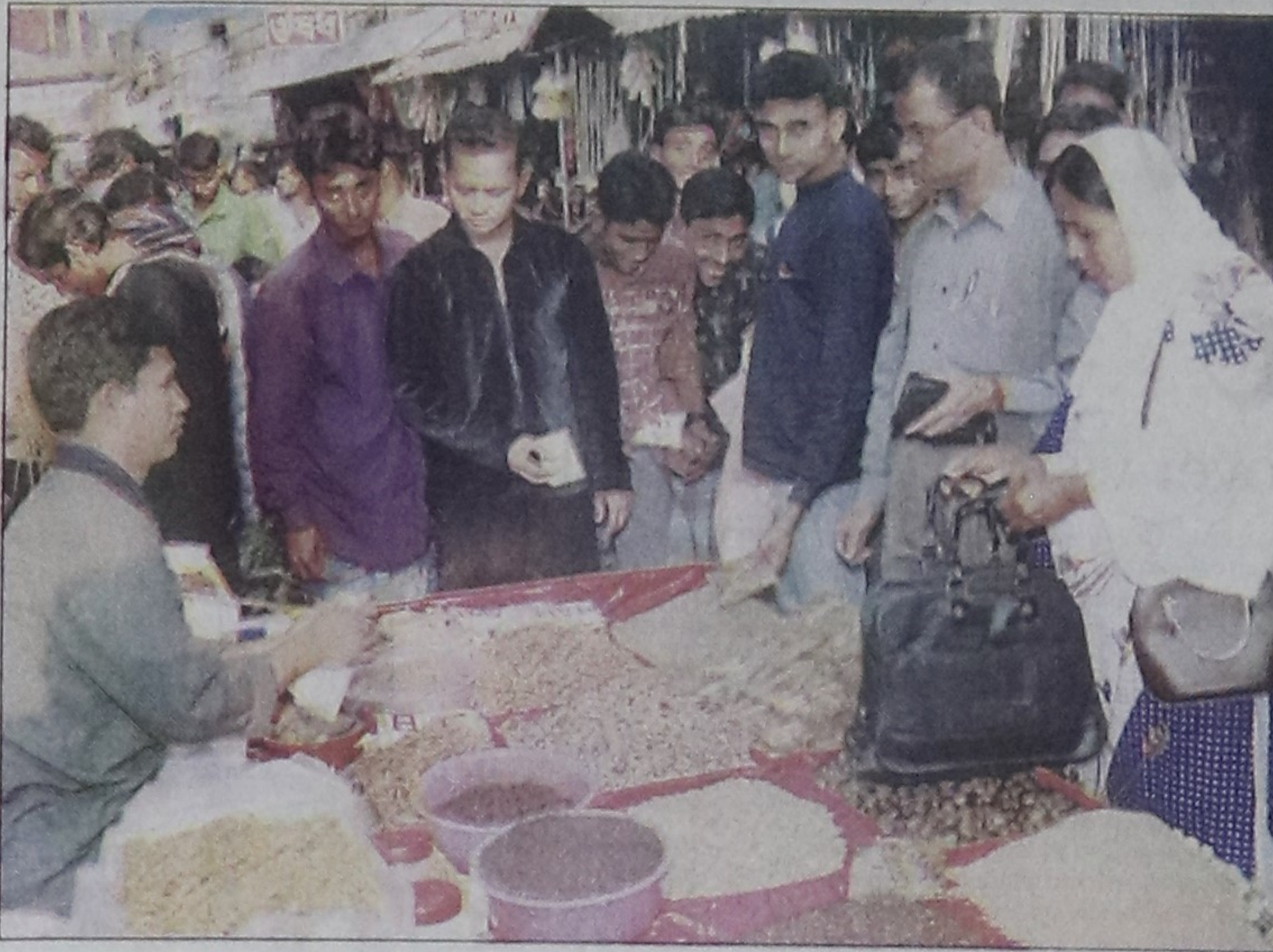
Buyers crowd a vendor selling spices in the city yesterday. With Eid only a couple of days away, demand for spices went up sharply.

Established in November 1994, the AIUB has 2,500 students and three faculties which offer bachelor degree in computer science, computer engineering and electrical engineering.