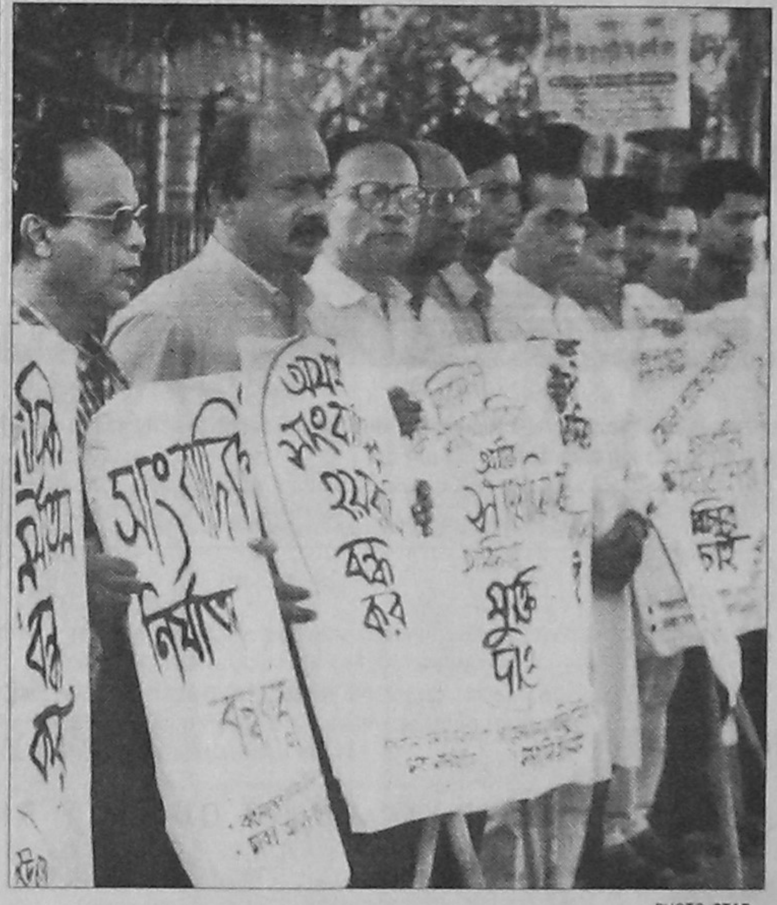
Bangladesh Federal Union of Journalists (BFUJ) formed a human chain in front of the National Press Club yesterday protesting repression on journalists and demanding release of arrested journalists.

People seeking to get French visa will have to submit non-refundable fees at the time of submitting their applications from January next year. The procedure was changed in line with the European Union decision adopted last year, a French Embassy press release said here yesterday. Applicants must submit visa forms duly filled in along with relevant documents and necessary visa fees depending on the type of their applications from January, it added.