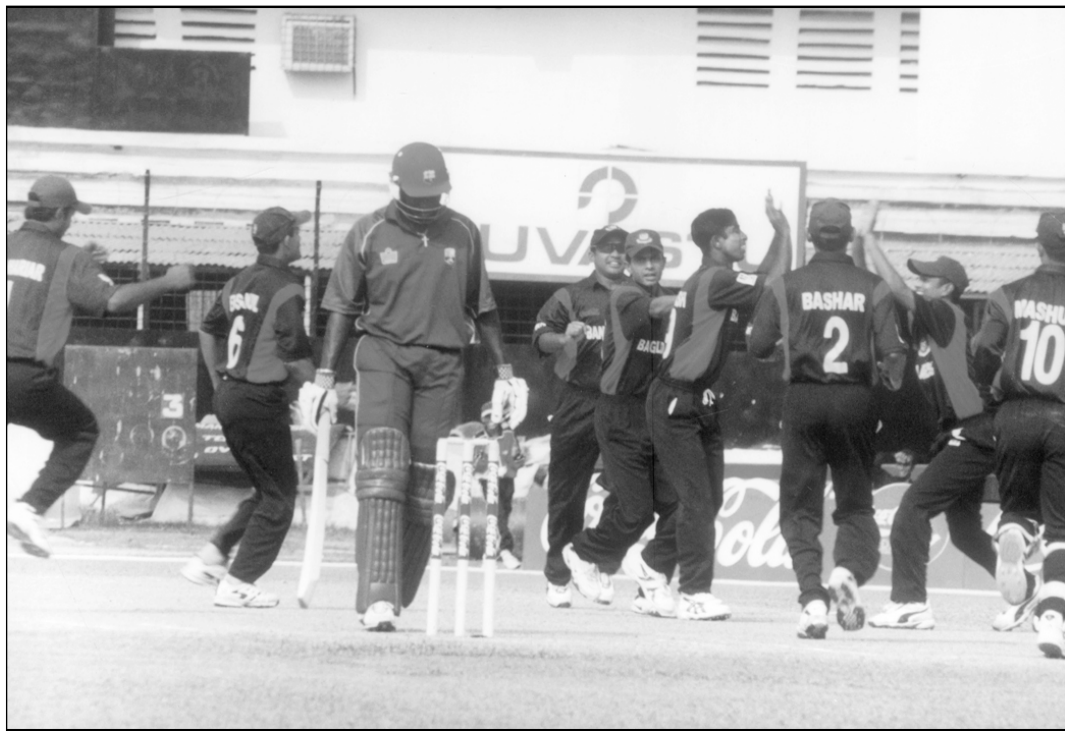
Bangladesh players celebrate the fall of West Indies opener Chris Galye.

CG: I can't say much since I have not seen much of them. All can I say is that they continue to work hard and try improving their game.