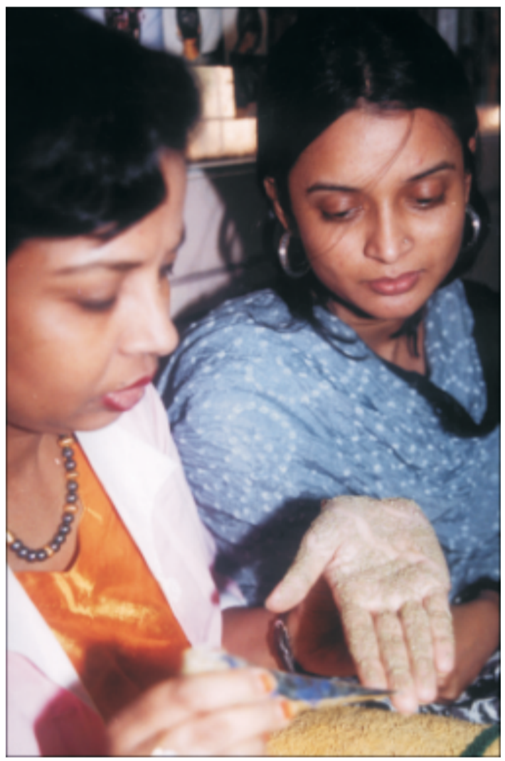
A beautician paints mehendi patterns on a woman's hand at a city beauty parlour yesterday on the eve of the much-awaited Eid-ul-Fitr.