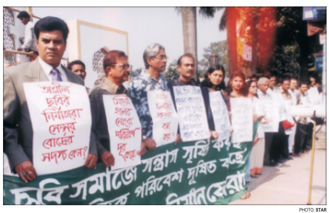
Members of the Filmmaking Forum stand in a human chain in front of the High Court in the city yesterday to protest the production of sleazy films and induction of producers of vulgar movies in the Censor Board.