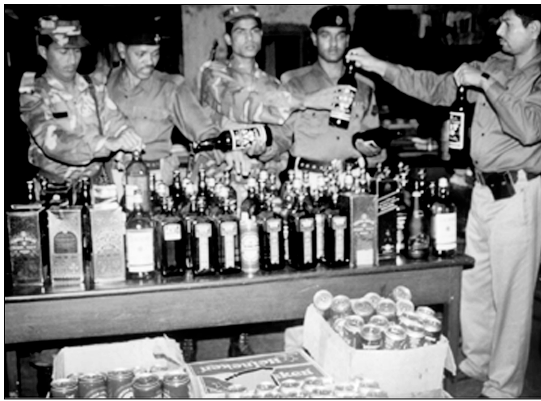
A policeman passes a bottle of alcoholic drink on to an army man at a camp in the port city of Chittagong yesterday. A team of joint forces seized huge foreign alcoholic drinks in a midnight raid.