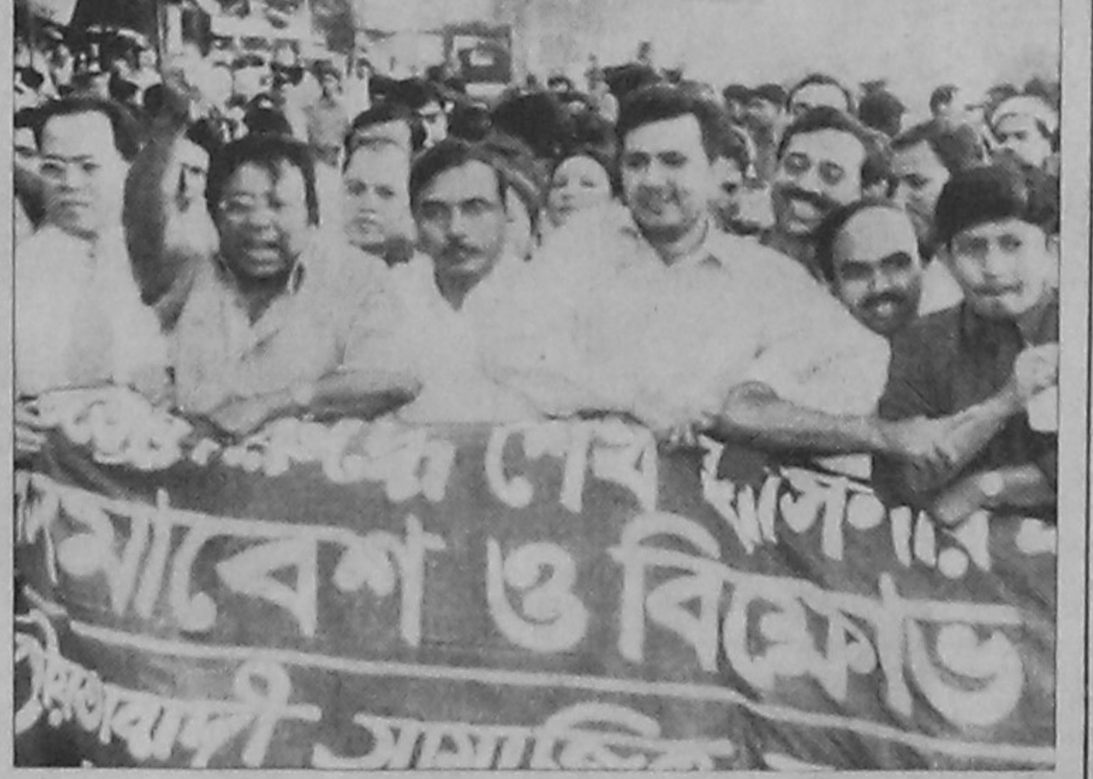
The Jatiyatabadi Samajik Sangskritik Sangstha staged a demonstration in the city yesterday protesting opposition leader Sheikh Hasina's statement abroad.