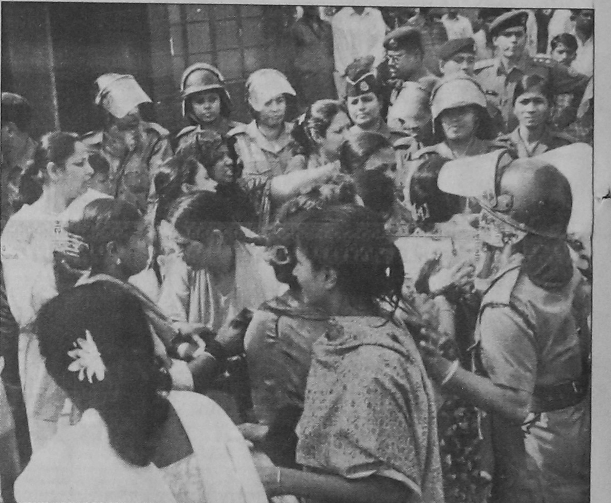
Police intercept a procession of the Jubo League at Tophkana intersection in the city yesterday when it was protesting 'false propaganda' against Awami League President Sheikh Hasina.

British High Commission in Dhaka will remain closed to the public on December 5 on the occasion of the holy Eid-ul-Fitr, a High Commission press release said yesterday. The High Commission's offices in Chittagong and Sylhet will also remain closed on the day.