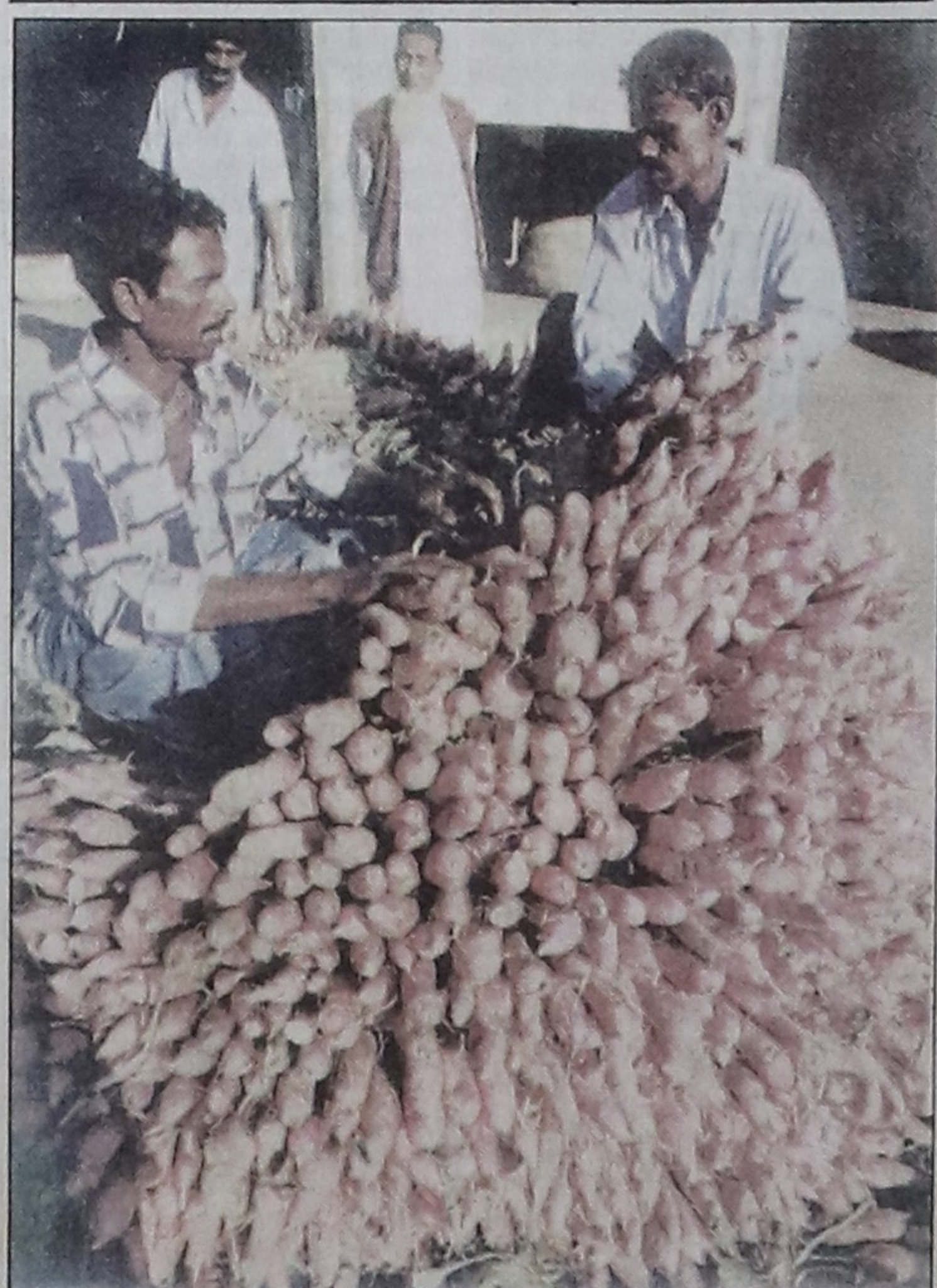
There has been bumper production of winter vegetables in the country this season. Photo shows a seller sitting with a large stock of radish for prospective buyers at Karwan Bazar in city yesterday.

All relatives and admirers have been requested to attend the chehlum.