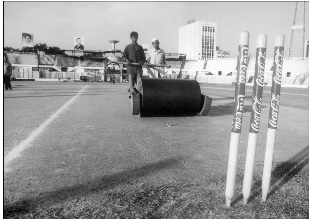
GETTING READY FOR THE WINDIES: The Bangabandhu National Stadium pitch is being rolled yesterday. International cricket is again coming to the big bowl tomorrow with Bangladesh taking on West Indies in the second one-day international.