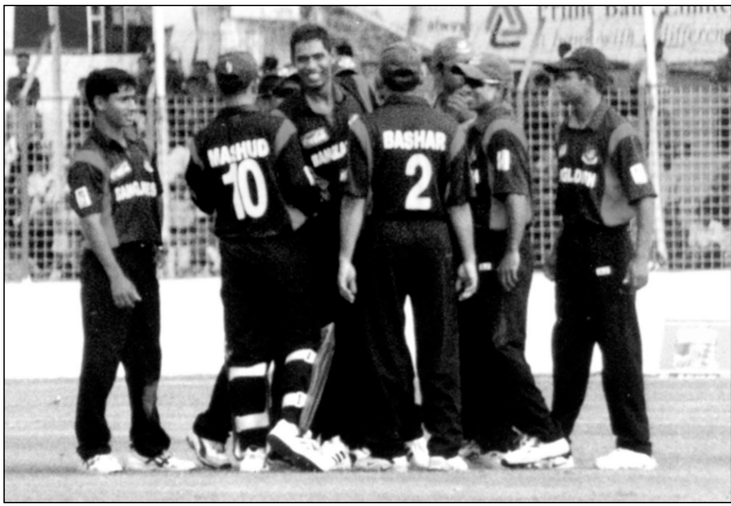
Bangladesh players celebrate the fall of West Indies opener Wavell Hinds.