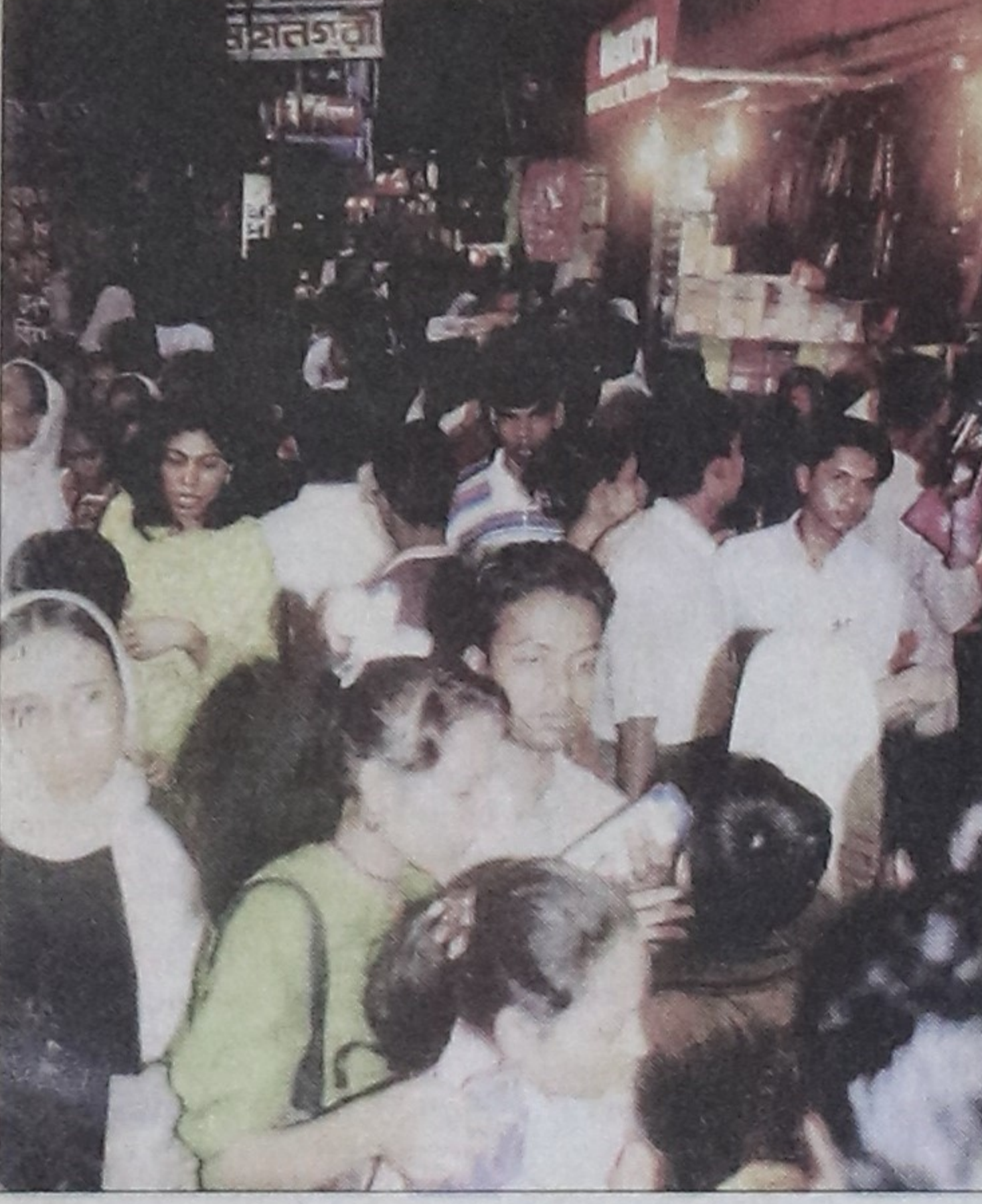
A large number of people through the Gausia Market in the city yesterday, the weekly holiday, as shopping picks up ahead of Eid.