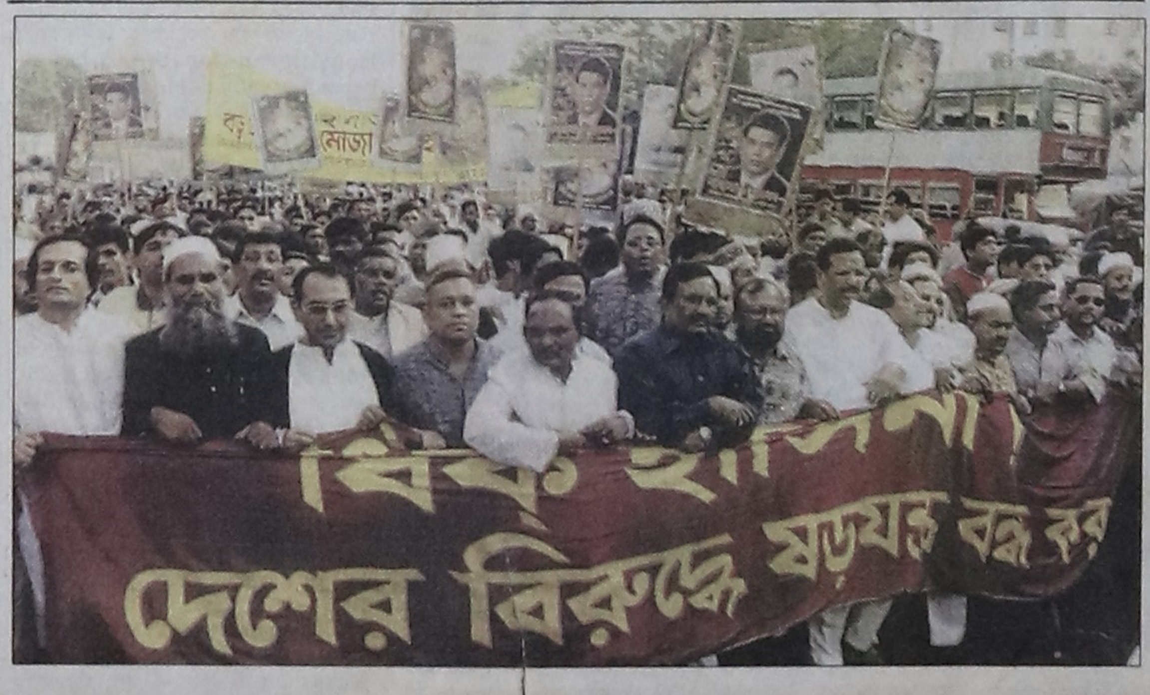
The BNP look out a protest procession in the city yesterday alleging propaganda by opposition leader Sheikh Hasina abroad.