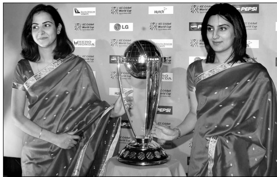
Models display the trophy of the 2003 Cricket World Cup, crafted in silver and gilt, in Indian capital New Delhi yesterday. The trophy, valued at 62,000 dollars, is currently in India and will travel to all other countries taking part in the tournament to be held in southern Africa.

Flower, a top-order batsman who also bowls left-arm spin, is one of Zimbabwe's most experienced players, having featured in 187 one-day internationals and 63 Tests. He took one for 52 off 10 overs on Wednesday.