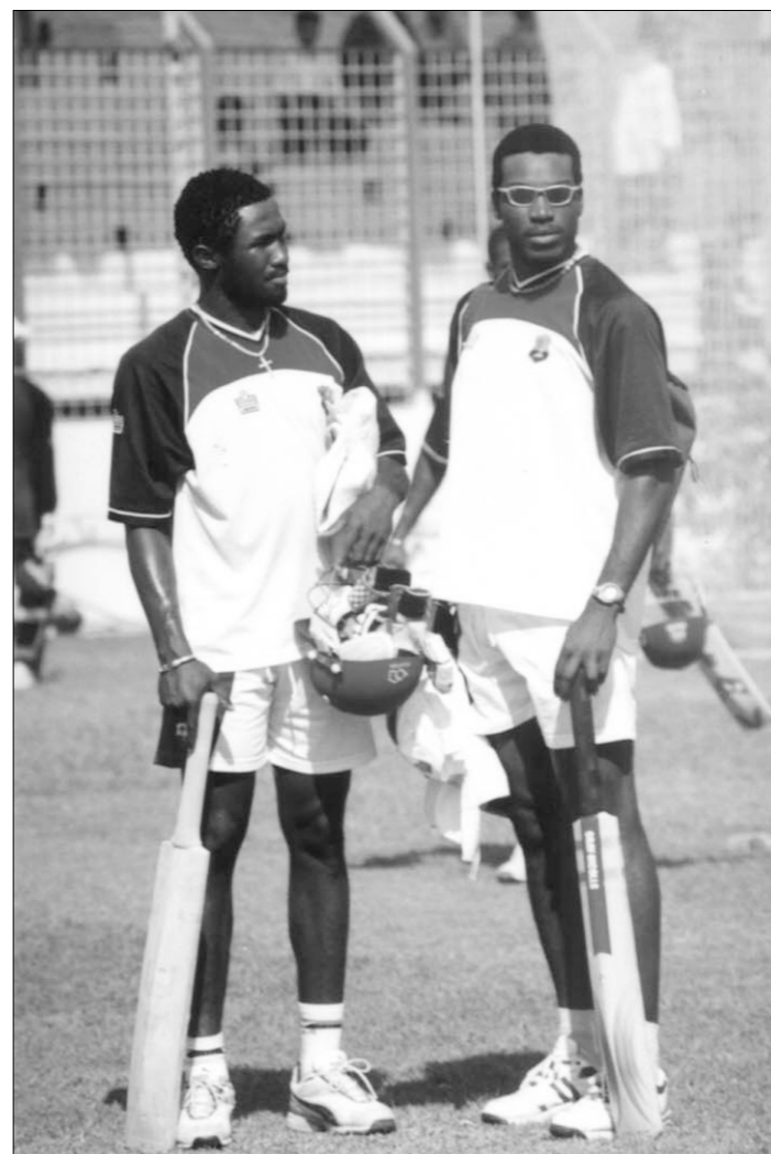
DEMOLITION MEN: West Indies openers Wavell Hinds (L) and Chris Gayle are about to take to the practice field at the MA Aziz Stadium in Chittagong yesterday.