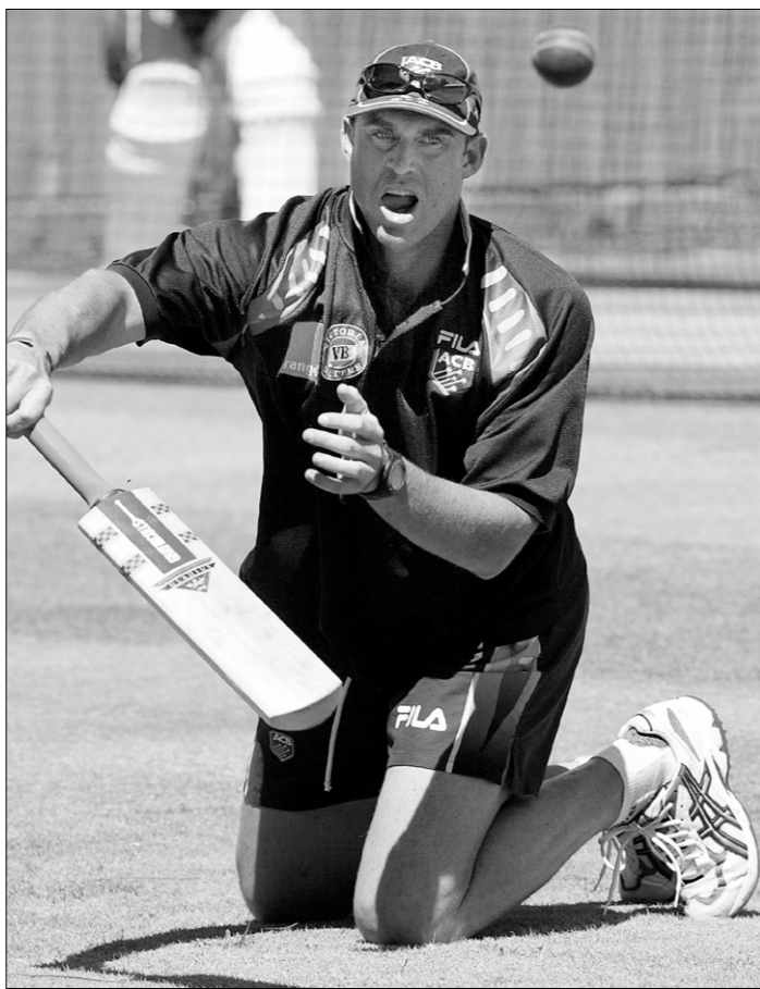
Australia opener Matthew Hayden during the team's practice at the WACA Ground in Perth yesterday.