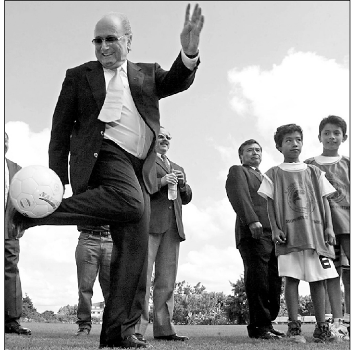
LEARN IT FROM THE FIFA BOSS! FIFA President Joseph Blatter shows off his ball juggling skills as some local children look on during the inauguration ceremony of a training centre in Guatemala City on November 26.