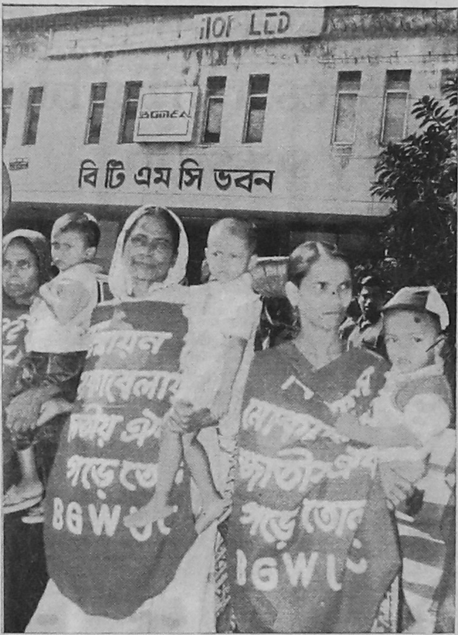
Garment workers holding children in their lap formed a human chain in front of the BGMEA office in the city yesterday demanding payment of Eid bonus and salary arrears.