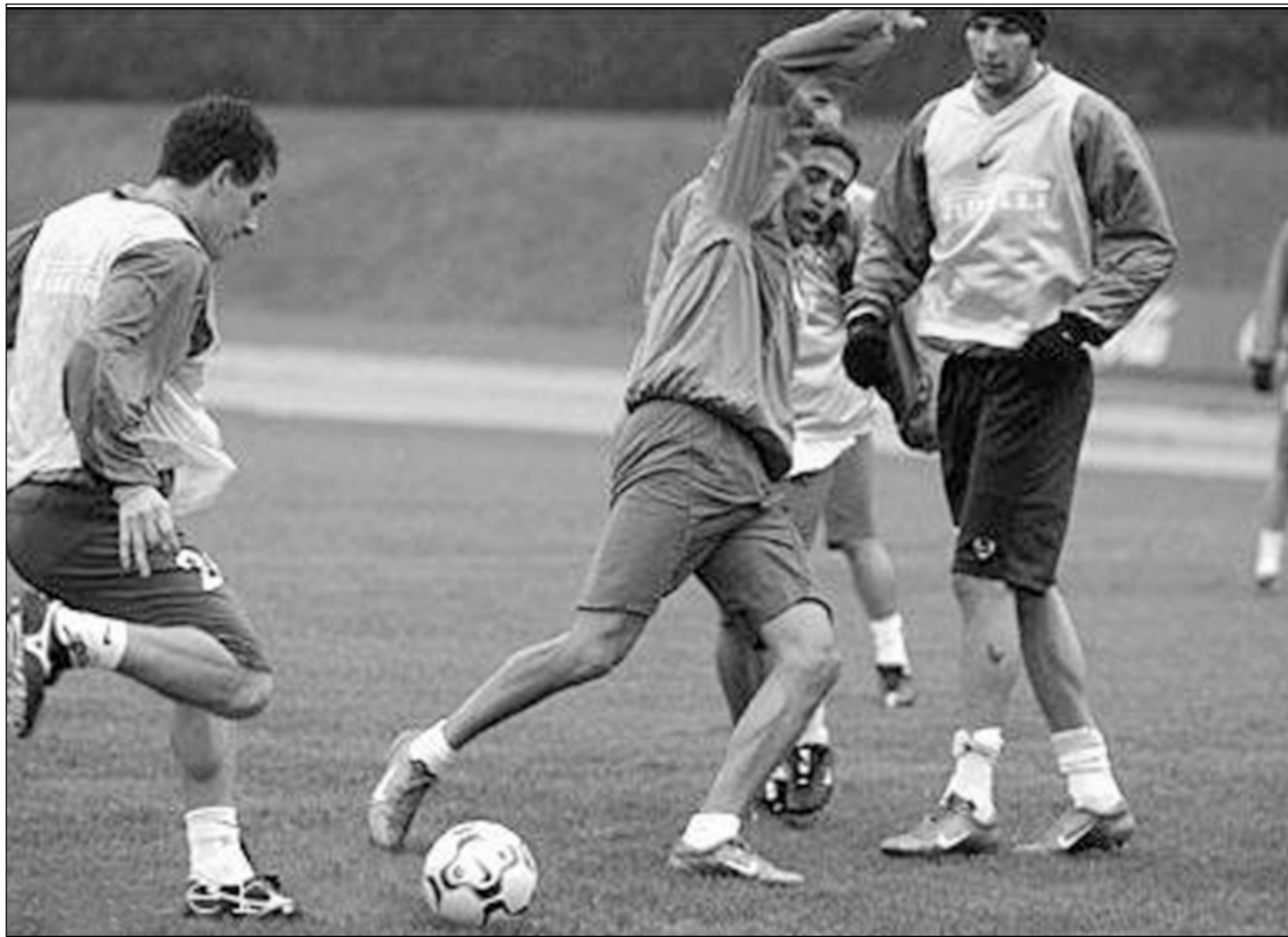
Inter Milan's super-strikers Christian Vieri (L) and Hernan Crespo locked in tussle during a training session at the club's Appiano Gentile base on November 25.