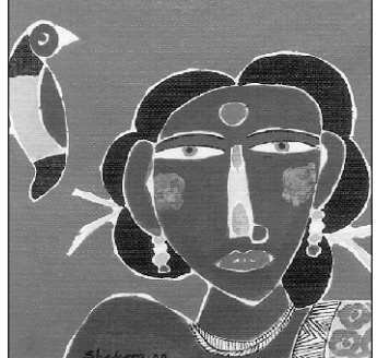
Abdus Shakoor. Rupabaty. Water colour