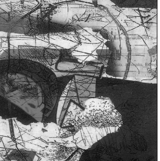
Rafi Haque. Untitled. Print

of gray blotches arranged subtly on a white jagged bar which is crisscrossed boldly with predominating lines in horizontal, vertical and triangular forms that appear like mini mountains, all combining to display the modern mind in turmoil. This bar is held by a backdrop of dramatic black and outlined by curls of soft pinkish gray to lend interest to the composition.