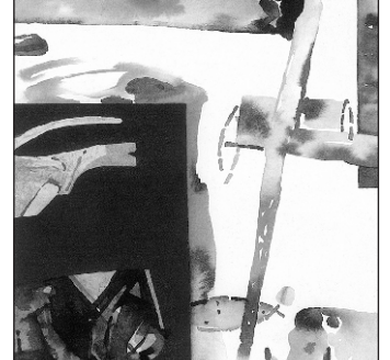
Mahmudul Haque. Painting-I. Water colour