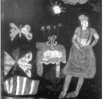
Rokeya Sultana. Laura's world. Etching aquatint