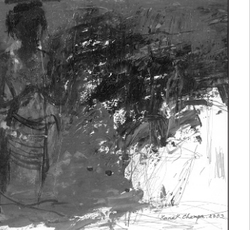
Kanak Chanpa Chakma. Tribal women. Acrylic