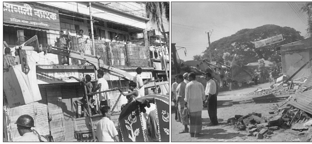
(Left) Unauthorised structures were demolished in a joint drive conducted on November 19 by army and police on Ram Babu Road in the Mymensingh Municipality area while (right) in Sirajganj another drive was conducted recently where 200 illegal structures on the New Dhaka Road and Sher-e-Bangla Road areas were demolished by the Roads & Highways Department authorities.

owners of these marked motor-bikes went into hiding. Some of them are now seen moving by rickshaws. Most of the motor-bike owners were engaged in extorting money from the local businessmen in the town silently. 'Always we were compelled to meet their demands whenever they or their representative came to us with their multi-colored motor-bikes, said a businessman in Sirajganj town on condition of anonymity. While talking to The Daily Star, more than half a dozen shop owners at New Market and AB Supper market in the town told that they got rid of silent extortion by these extortionists. They said the criminals are not seen after the army crackdown on miscreants. But prominent businessmen in the town have expressed their doubts whether the criminals would claim toll including the arrears after the withdrawal of army. They demanded a permanent solution so that criminals do not return on conclusion of the crackdown. 'Earlier, we used to receive telephone calls or letters demanding money for holding meeting, cultural function and many other purposes. But it has been stopped totally,' said a renowned businessman in the town. The drivers of bus and trucks also said that toll collection on the highway has been stopped in Sirajganj following the army crackdown on criminals.