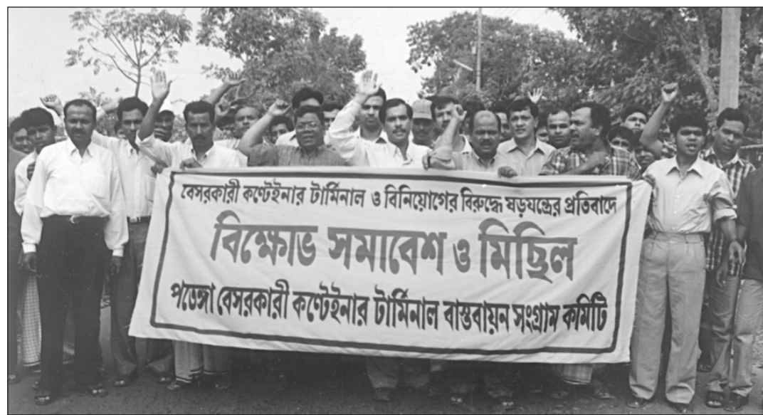
Patenga Private Container Terminal Implementation Action Committee organised a protest rally following a procession in Chittagong recently in protest against 'conspiracy' to thwart the move to establish private container terminal and investment.

850 MT, in Kotalipara upazila 50 hectares have been earmarked with a production target of 425 MT, in Tungipara upazila 50 hectares have been earmarked with a production target of 425 MT. Gopalganj is one of the quality onion producing districts in the country. It is also famous for producing quality onion seeds. 'Onion seed traders from Mymensingh, Jamalpur and Tangail district are now visiting different parts of the district to purchase onion seeds' local farmers said. Immediate measures should be taken to supply onion seeds to the farmers.