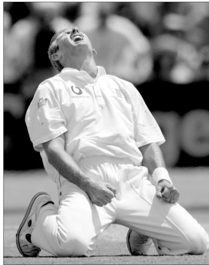
WHEN THINGS GO WRONG! England paceman Andrew Caddick shows his frustration after an appeal for lbw against Ricky Ponting was turned down on the third day of the second Ashes Test yesterday.