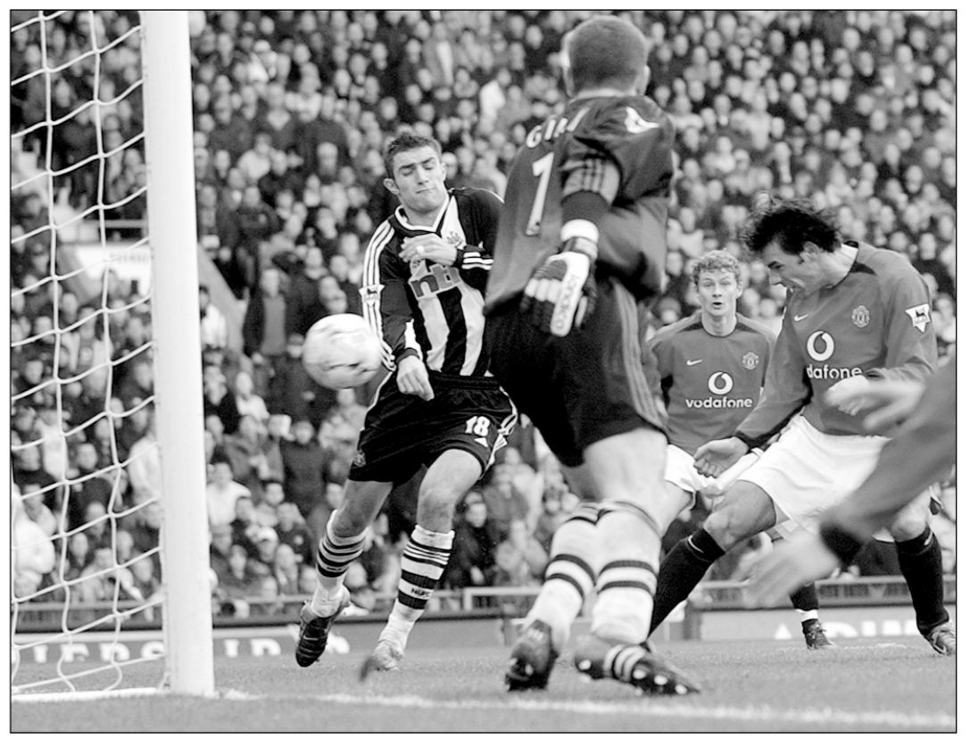
Manchester United's Ruud van Nistelrooy (R) heading in his hat-trick goal against Newcastle United during their Premiership clash at Old Trafford yesterday.