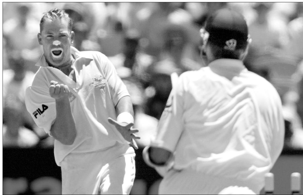
Australian spin-king Shane Warne roars for joy after taking the wicket of Andy Caddick of England on the second day of the second Test yesterday. Warne finished with 4-93 to become the most successful Test bowler in 2002.