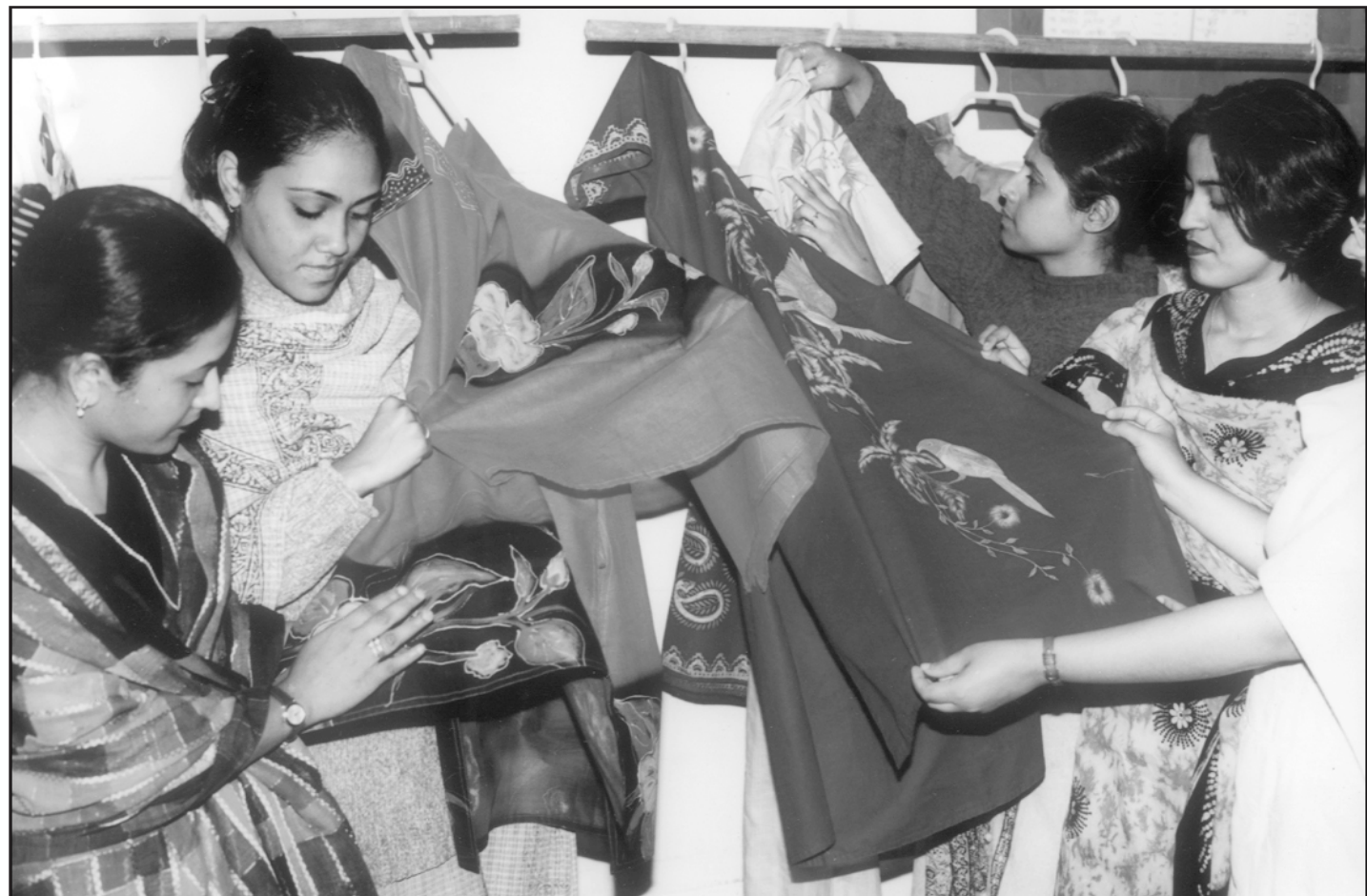
City market is humming with Eid shopping as people have started visiting garment stores. Every apparel shop in the New Market area is found busy with customers browsing various types of clothes.

Since the formation of Privatisation Board in 1993, which was re-named as Privatisation Commission in 2000, a total of 41 SoEs have been privatised.