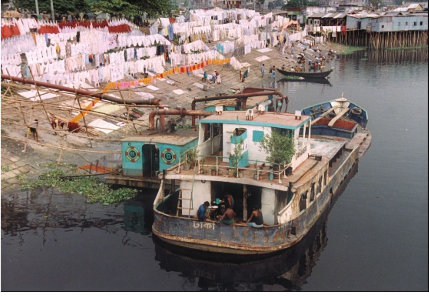
Washer-men dry clothes in sunlight on the bank of the Buriganga in the city yesterday. Many washer-men wash clothes in the river, itself contaminated with dumped waste. A drive to clear illegal encroachers off the riverbank is already on. (Editorial on page 4)