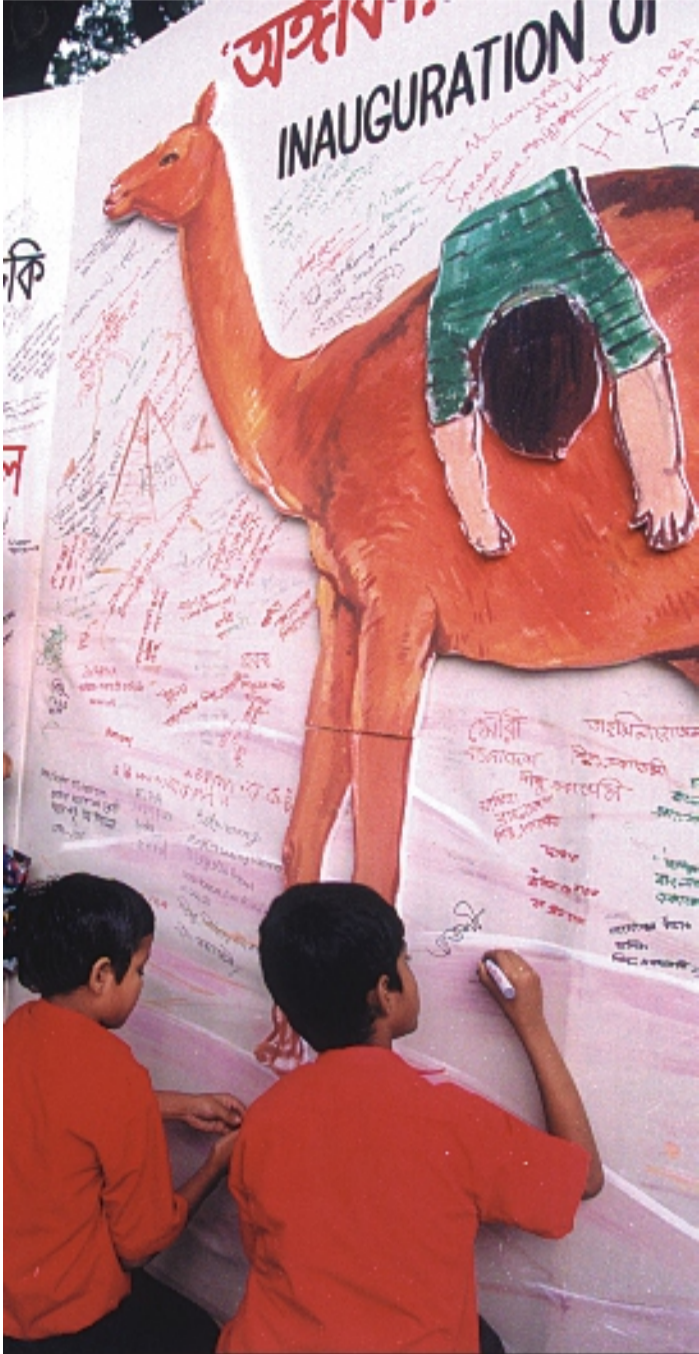
Two students sign a huge paperboard at the inaugural event of a mass signature campaign in the city yesterday to protest the use of children as camel jockey in United Arab Emirates (UAE).

REGD. No. DA 781 • VOL. XII No. 223 • DHAKA SATURDAY NOVEMBER 23, 2002 • BHADRA 18, 1409 BS • ZAMADIUS SANI 23, 1423 HIJRI • 16 PAGES PRICE: Tk 7.00