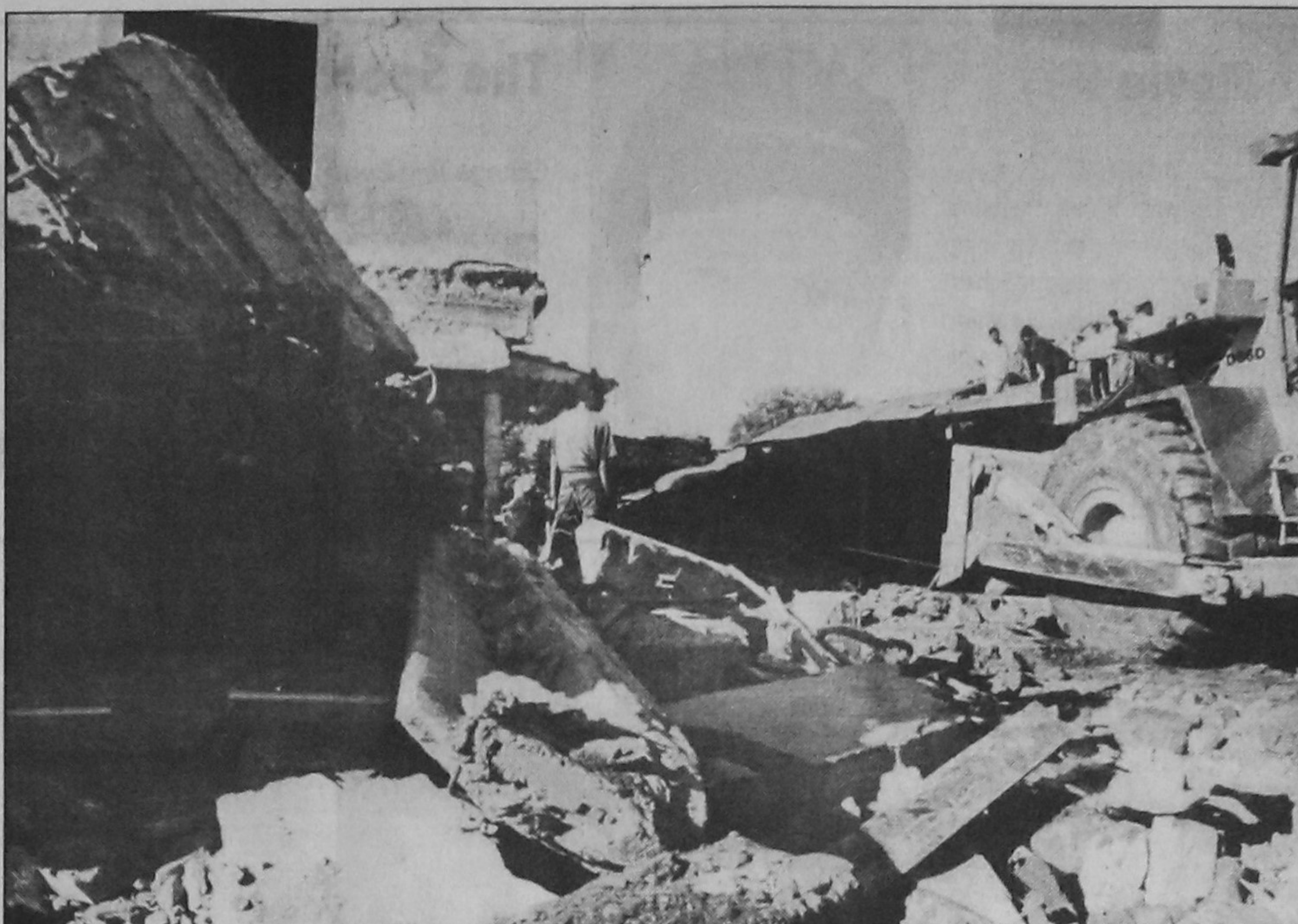
The Bangladesh Inland Water Transport Authority bulldozed unauthorised structures along the river Buriganga in Babupura area yesterday during its ongoing drive to remove encroachments on the river.