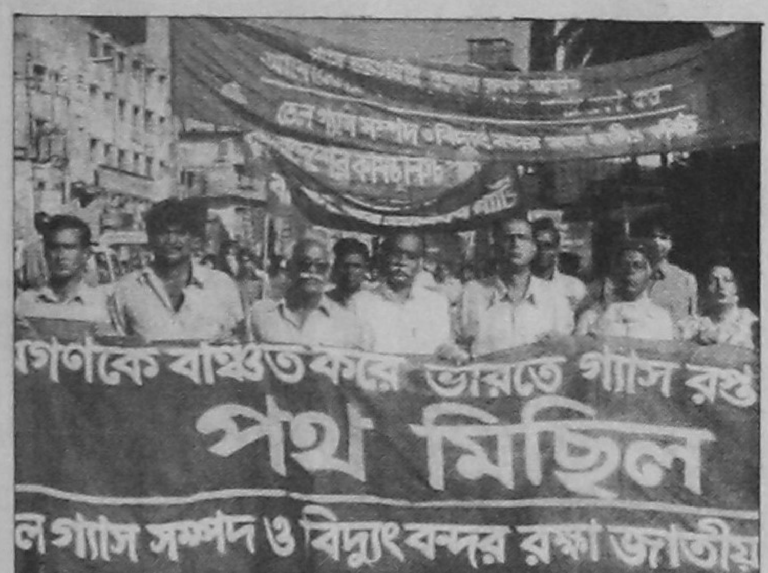
The national committee for protection of oil and gas resources and power and port took out a procession in the city yesterday protesting the move to export gas.

The madrasah curriculum has to be modernised and updated in such a manner that the students after attaining degrees at different levels can sit for the civil service and other competitive examinations and get jobs in the public and private sectors alike, it said.