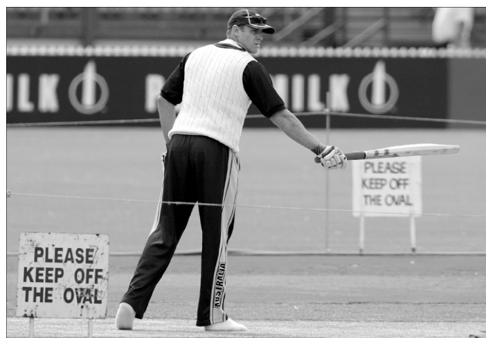
THEN, WHY IS HE THERE? Australia Test opener Matthew Hayden inspects the Adelaide Oval pitch during the team's practice session yesterday. The second Ashes Test begins here today.

Umpires: Steve Bucknor (West Indies) and Rudi Koertzen (South Africa).