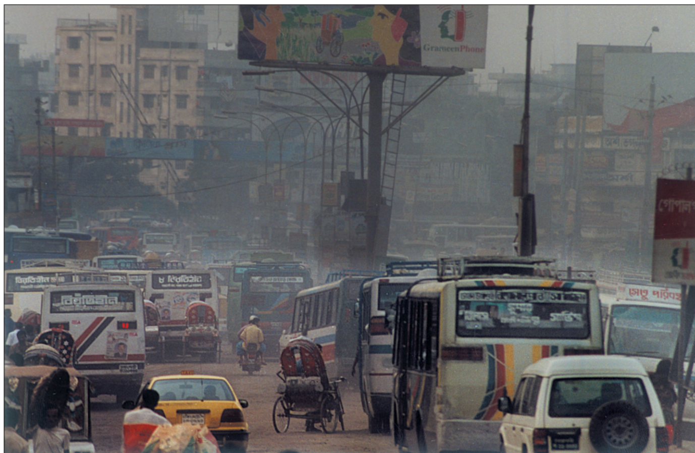
Dusts twinned with black smoke from faulty vehicles spread a foggy blanket, a common hazard, over a Sayedabad road in the city yesterday. As winter sets in, the problem gets acute.