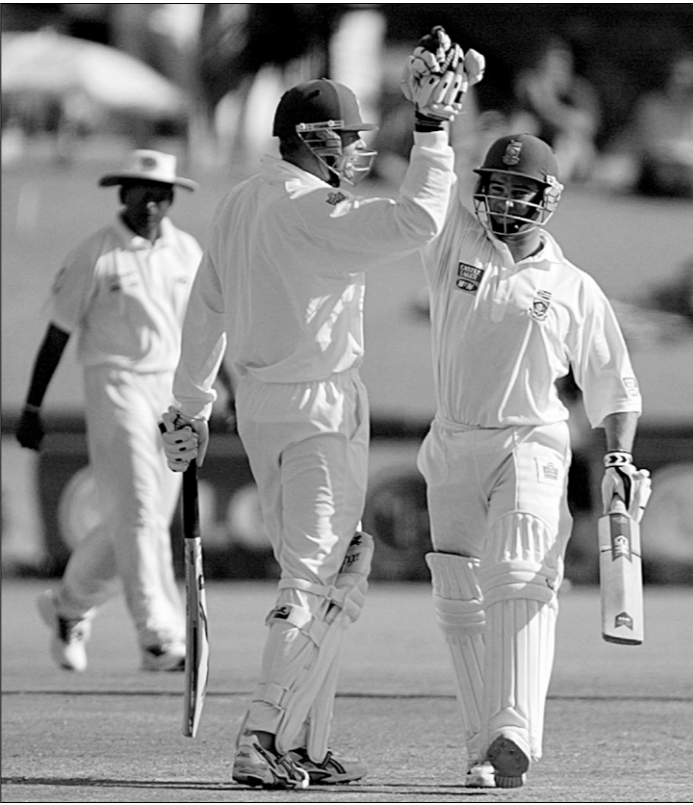
THAT WAS CLOSE! South African captain Shaun Pollock (L) and wicket-keeper Mark Boucher celebrate the winning runs against Sri Lanka in the 2nd Test at Johannesburg yesterday.

the first ten balls of the day to expose the Sri Lankan tail, exactly as South