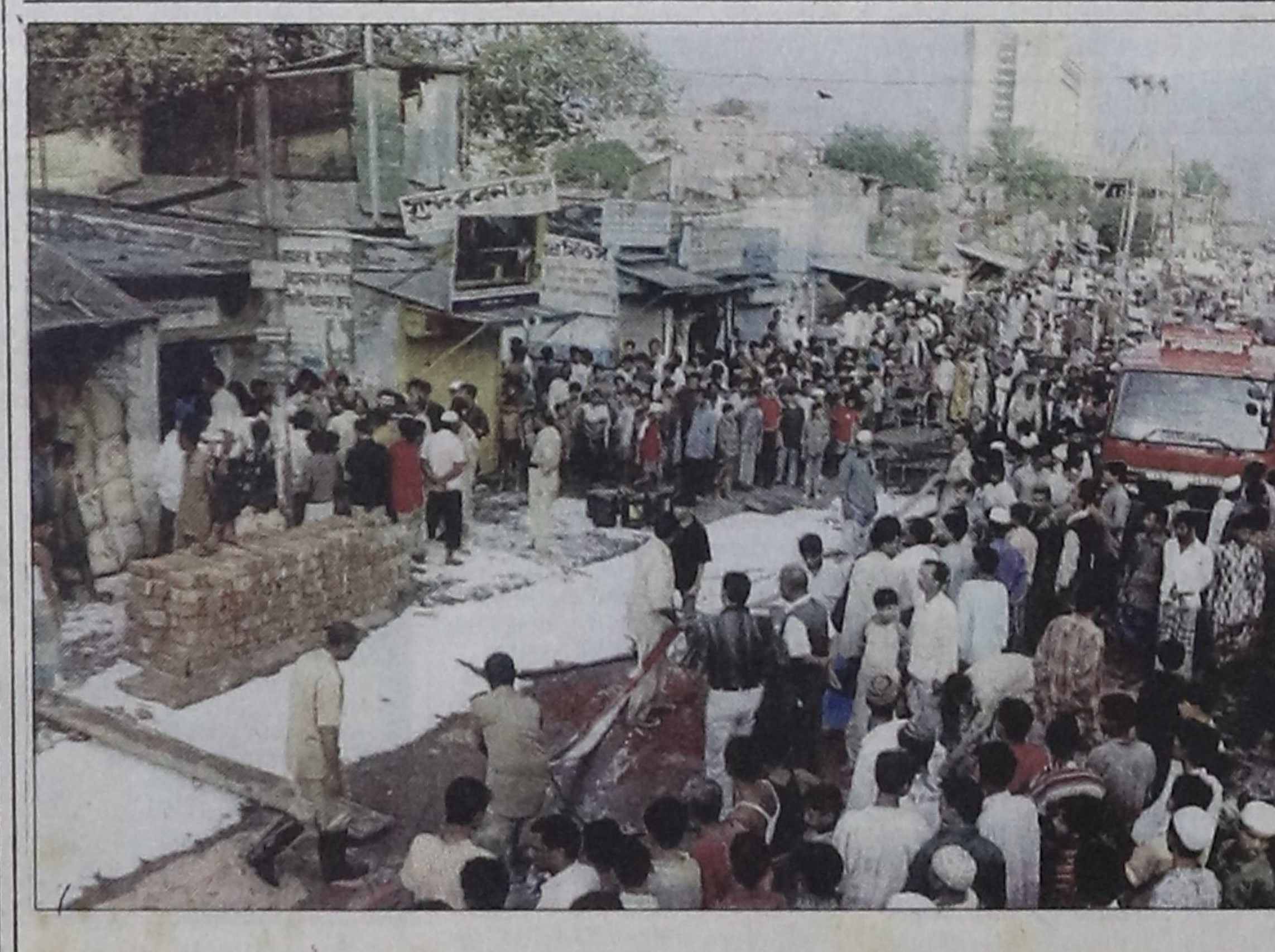
Firefighters brought under control a fire that broke out at a rubber factory at Nimali in the city yesterday.