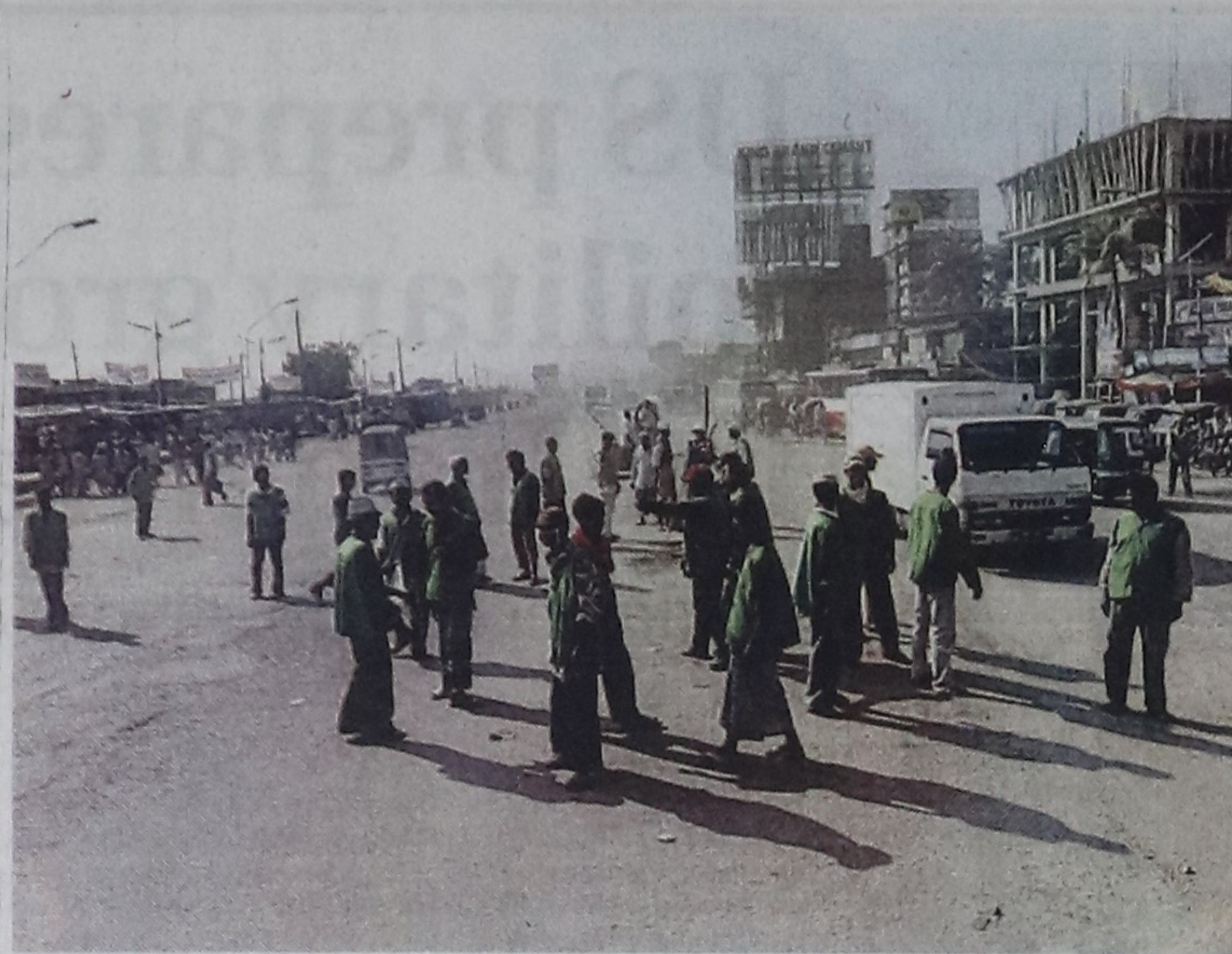
Members of community traffic police engaged in removing traffic congestion at Gabtali in the city yesterday.

Evening screenings will take place from 6:30 pm at the Goethe Institut from November 22 to December 2. Details are available at Drik Picture Library and Pathshala. Web site: www.chobimela.org