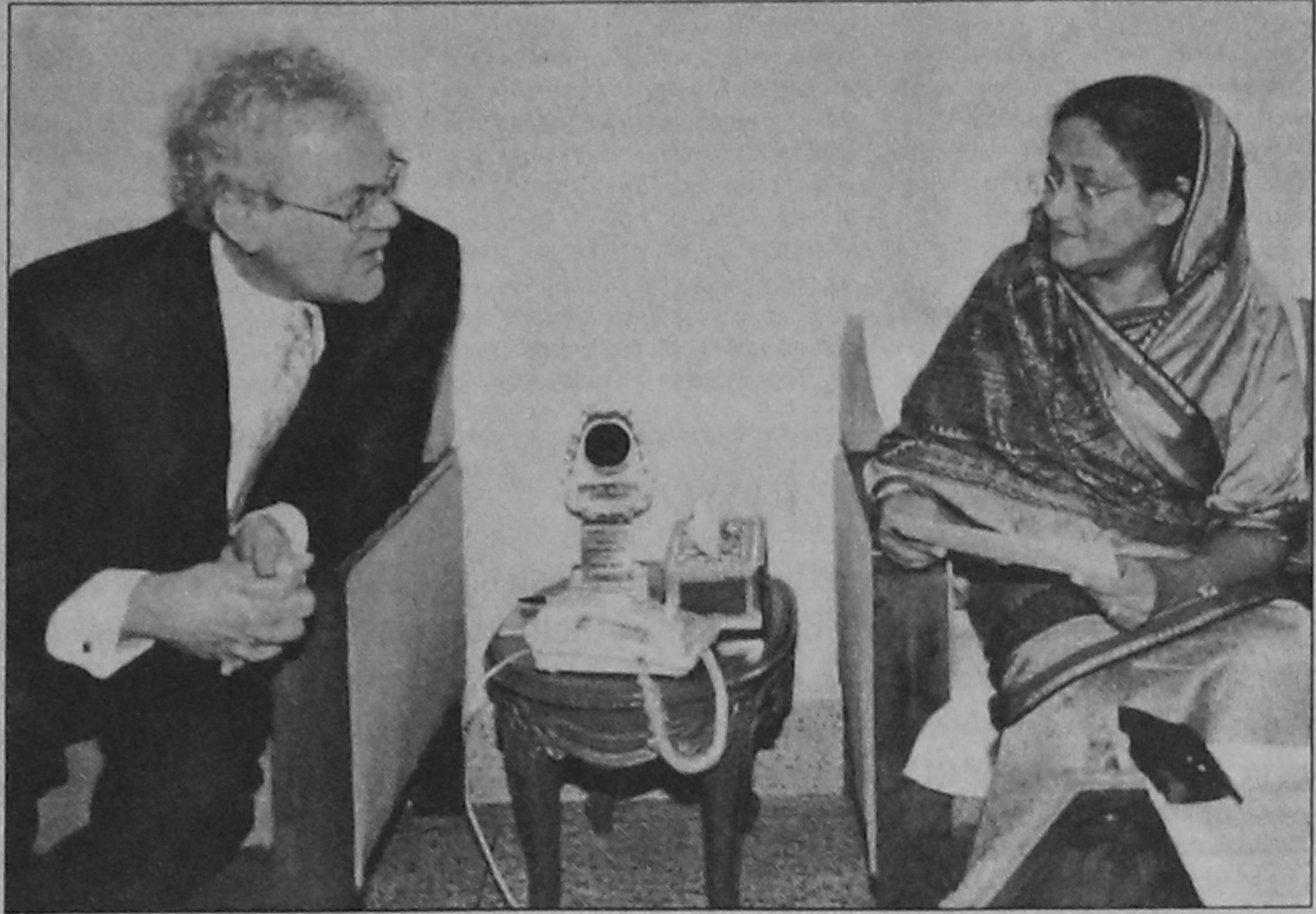
President of the Australia Chapter of the Commonwealth Journalists Association hands over letter of invitation to Leader of the Opposition in Parliament Sheikh Hasina at her Sudha Sadan residence in the city yesterday.